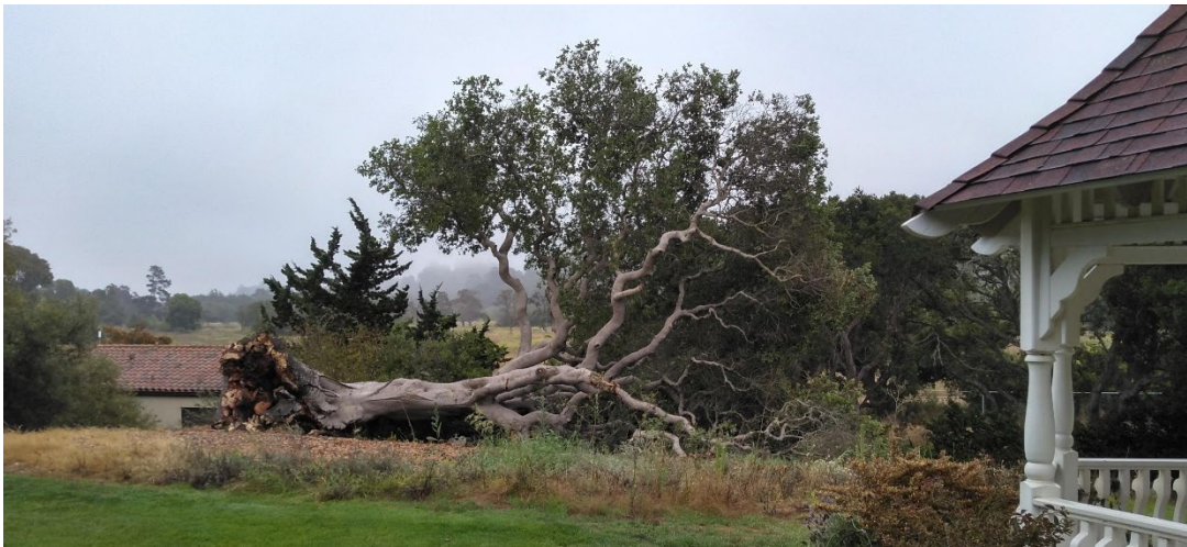
Fallen oak tree at Palo Corona Regional Park – Rancho Canada Unit