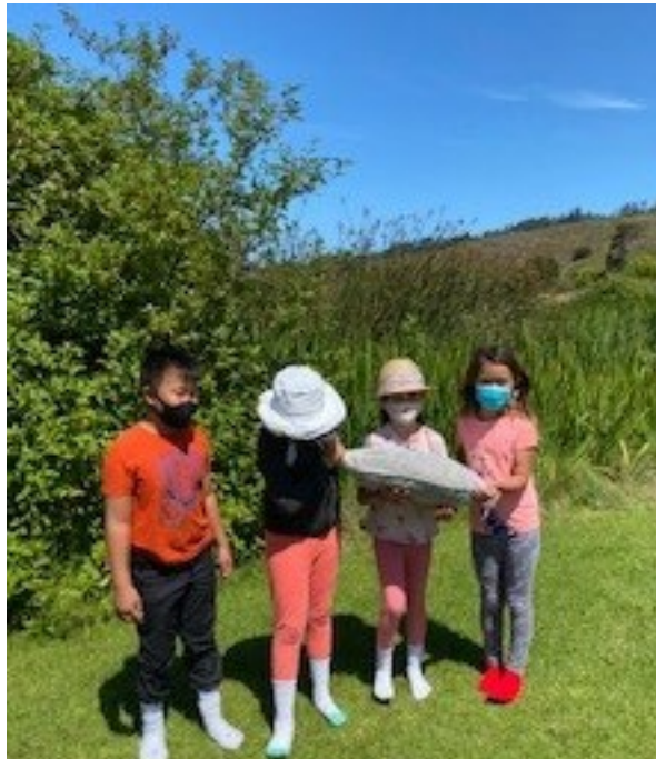
MEarth "Seed Hunters in Socks"

Three (3) weeks of campers from grades 3-10 participated from June 21-July 23.