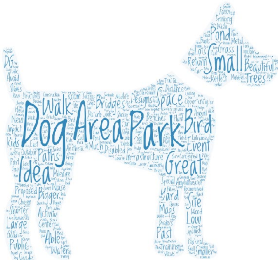
Open House Welcome Station Word Cloud

Days in planning, creating posters and collateral information, and setting-up was testimony to ranger, administration and EECO staff uniting to create a successful in-person open house event. The public repeatedly expressed their appreciation. The compiled data and input are being synthesized and will provide guidance on the development of the park.