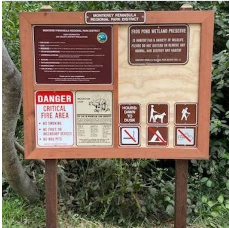
New information panel at Frog Pond Wetland Preserve