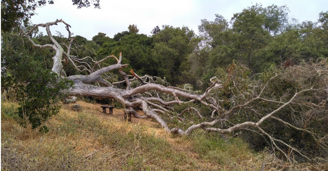
Fallen oak tree at Frog Pond Wetland Preserve