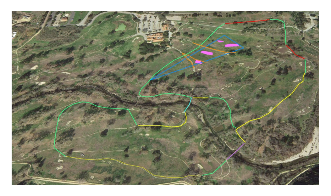
Proposed Cross-country Course/Fitness Trail at the Rancho Canada Unit

1. BSIM Cross-Country Course: Ops and Admin staff recently participated in a meeting with Big Sur International Marathon (BSIM) staff to discuss the possibility of BSIM underwriting trail improvements at Rancho Canada, in exchange for an agreement to host cross-country meets. The course would be limited to the east course and south of the Carmel River to allow for unobstructed public access to the Front Ranch even during a BSIM-sponsored event. Rangers are working with BSIM staff to develop the alignment and plan specifications.