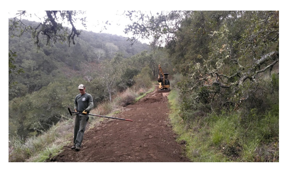
Rangers making trail improvements on existing trails

14. Winter Storm Damage: Rangers continue to address downed trees, clogged gutters, and blocked culverts following each storm that impacts the District. The District's San Clemente-Blue Rock property has been especially impacted due to 2020's Carmel Fire which created a hydrophobic environment in which runoff is not absorbed into the ground, but rather accumulates and deposits sediment into culverts, drain dips, and along roads, all of which need to be removed using hand tools and/or equipment (see photo below).