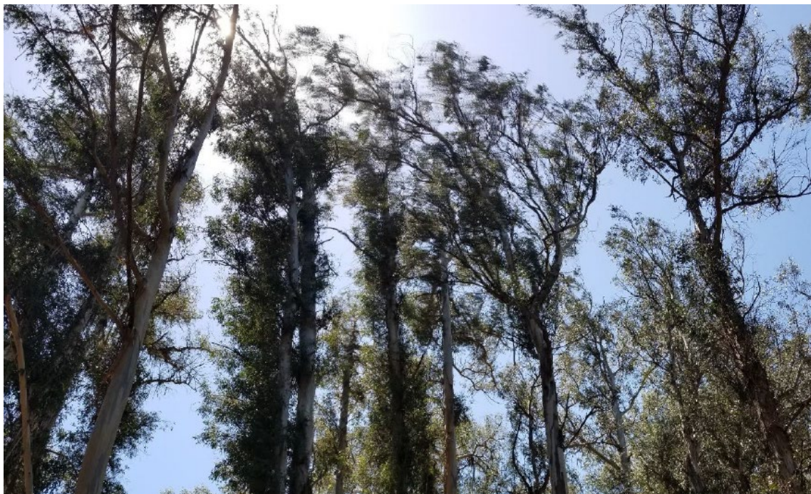
Figure 1. The canopies of Eucalyptus trees showing indicators of poor health and susceptibility to wildfire, including epicormic sprouting, evidence of past windthrow, and overcrowding which can increase the rate of fire spread.

In fall of 2022, staff worked with foresters and wildland resource managers to evaluate the eucalyptus grove and develop a memorandum (Memo) that outlined treatment recommendations for eucalyptus ( ATTACHMENT 1 ). The Memo documented that eucalyptus stands at the Park create an unnaturally high fire hazard, are detrimental to native vegetation, and should be removed in areas where it has expanded into native habitat or presents especially high fire risk ( Figures 1-4 ). The Memo also confirmed that the main stand of eucalyptus is unhealthy due to overcrowding and should be heavily thinned to improve the health of the stand, while also making it easier to prevent high fire fuel conditions from returning. In spring 2023, RCDMC agreed to serve as a technical advisor on planning and implementation of the eucalyptus removal and used its grant funding from Cal FIRE to secure Denise Duffy & Associates (DD&A) to assist with developing a detailed project description and CEQA compliance via the CalVTP.