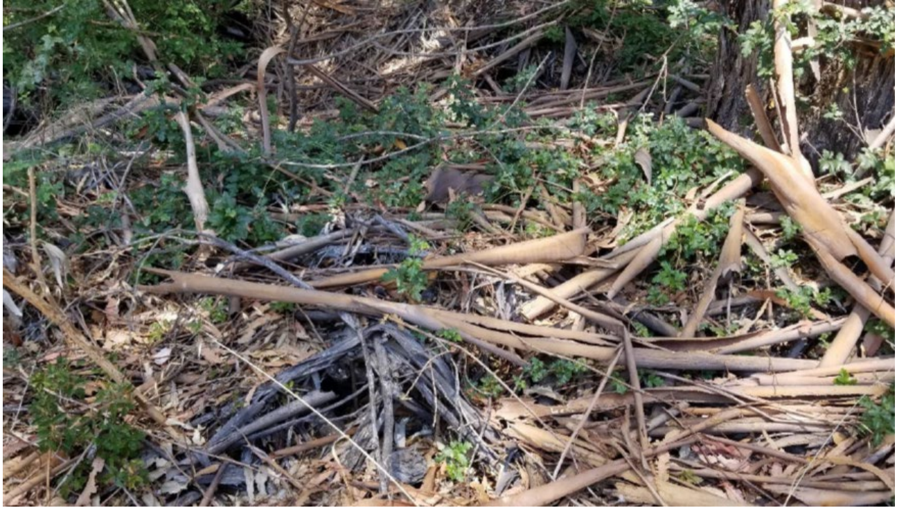
Figure 4. Heavily shaded understory conditions and bark debris smothering native understory growth and regeneration.