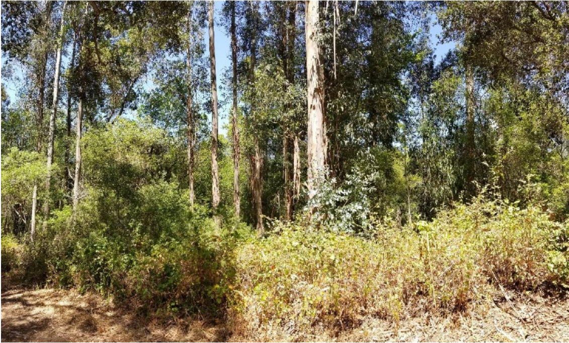
Figure 3. Young Eucalyptus trees encroach within the Carmel River Riparian Corridor.