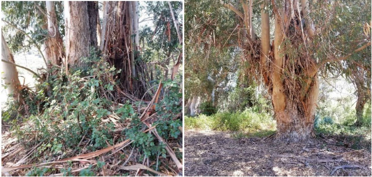
Figure 2. View of bark debris and leaf litter on the forest floor and suspended in the tree branches providing ladder fuels that increase risk of crown fires.