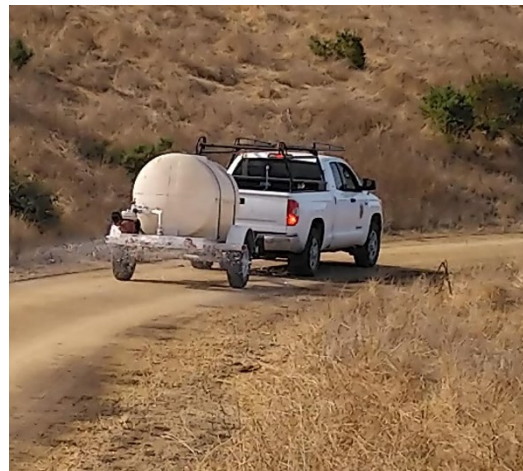
Ranger Jacob Sanderson watering the road using the District's water tender