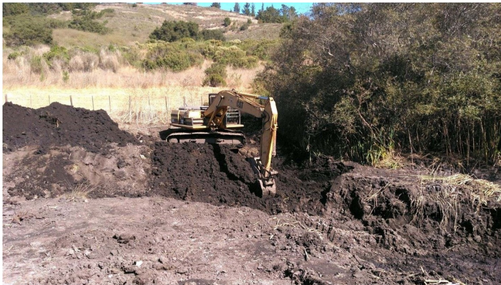
Tom "Little Bear" Nason using his excavator to remove overgrown vegetation and accumulated sediment from Animas Pond