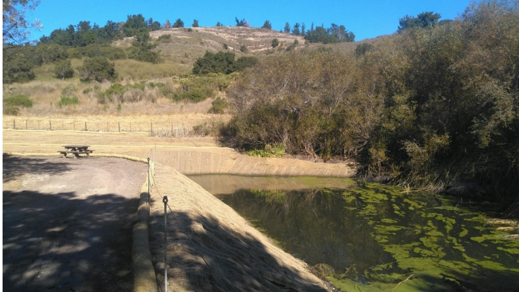
Rangers installed symbolic fencing along the pond's edge