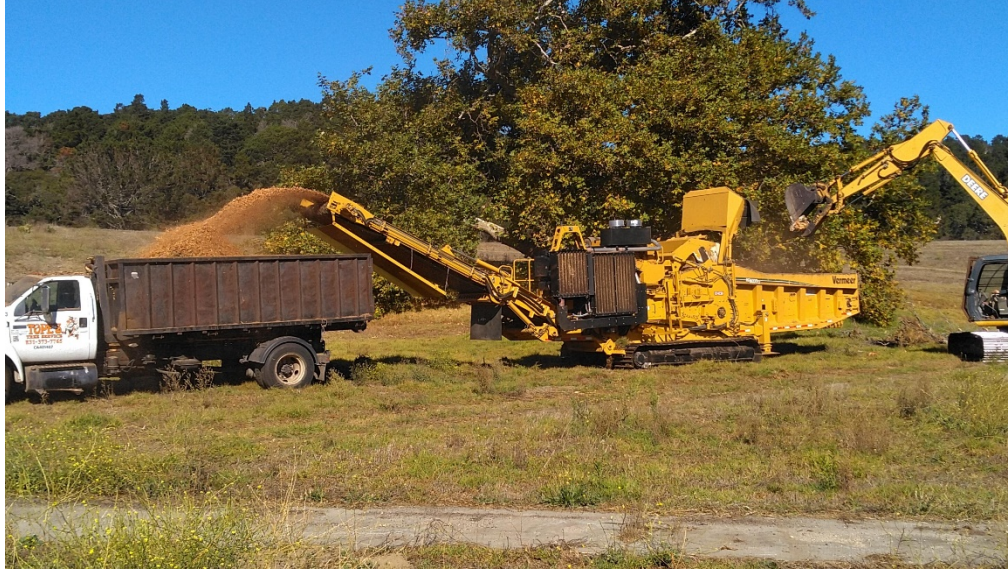
Tope's Tree Service owns a very large chipper/grinder capable of accommodating 30" logs