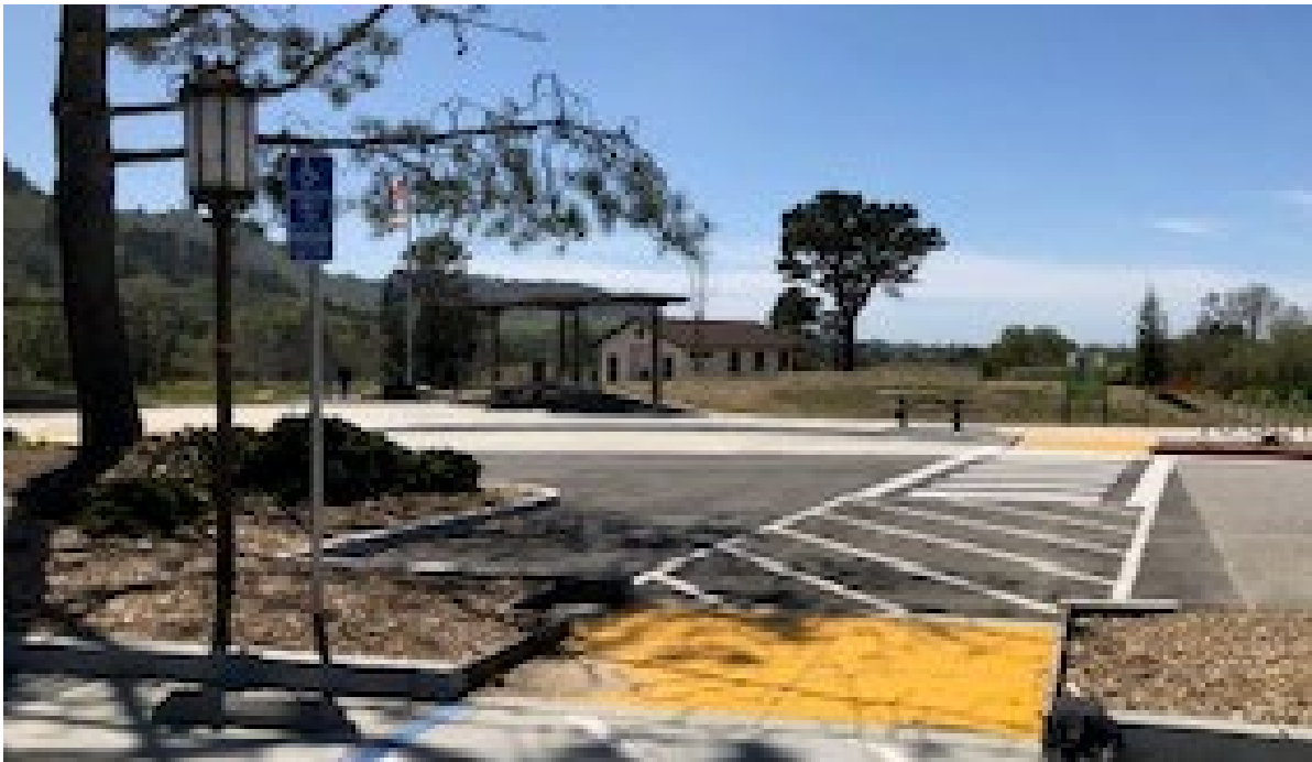
Grantor acknowledgement sign installed at Project B entrance (parking lot view)

A permanent grantor sign was prominently installed at the entrance to the Project-B site. This highly visible sign memorializes Proposition 68's contribution to this project. Project-B's progress reports have been jointly prepared by MPRPD's Project Manager, rangers, and the Ausonio construction management team. Ausonio's team continues to coordinate closely with Wedgewood to ensure no negative impacts affect the concessionaire's events. Tribal Monitors remain on-call to identify and avoid any potential negative impacts to cultural sites when excavation or other disturbance of soil occurs. No cultural artifacts were encountered in the past month. The team has also been working closely with SWCA's biologist to monitor the site for, and to protect, the federally listed California Red Legged Frog.