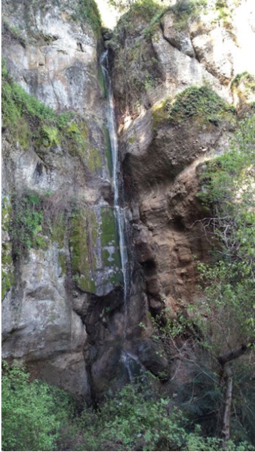
Waterfall Still Running