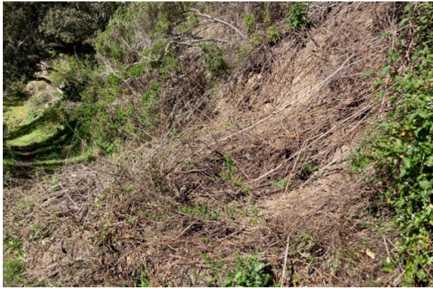
Slide along Whisler Trail