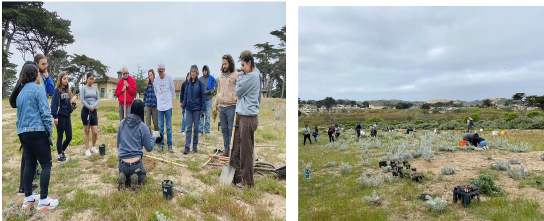
Volunteers Plant Seedlings in Oak Woodland, Native Plant Garden, and Dune Habitats