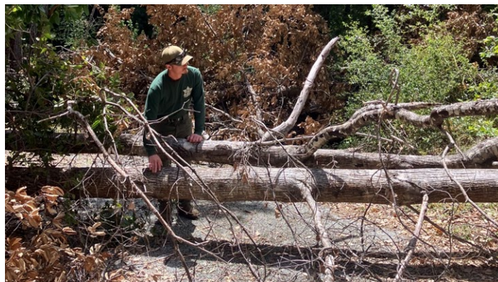
Several Trees Cleared at MCP's Davis House

Rangers were finally able to access Mill Creek Redwood Preserve (MCP) to address the myriad of trees downed across the driveway leading to the Davis House. Clearing these trees provides access for emergency vehicles to conduct structure protection in the event of a wildfire, as well as providing access for our MCP caretaker who monitors this site for illegal activity.