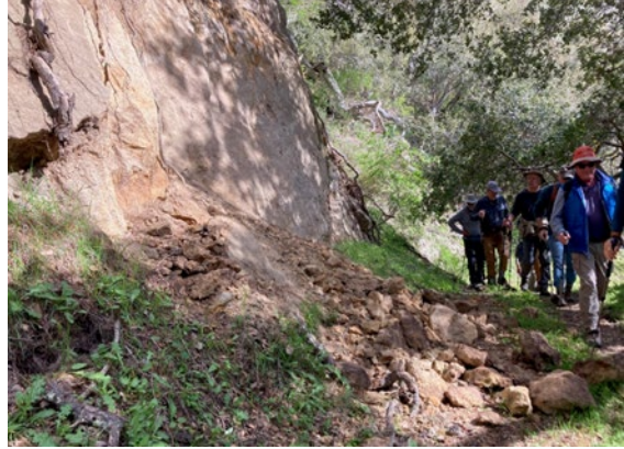
Slide on Wilson Ridge