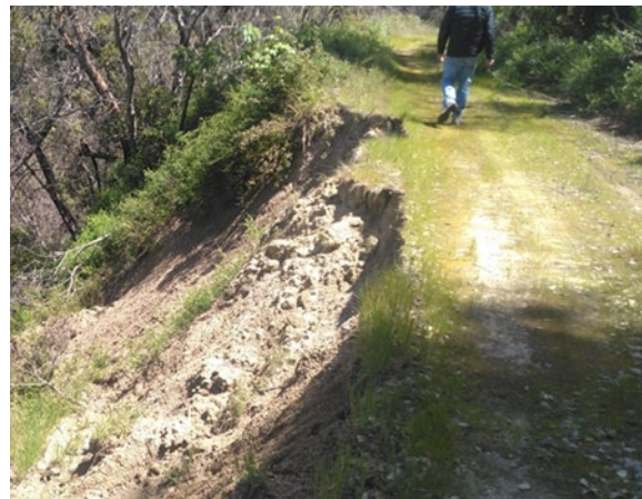
Adjuster Inspecting Road Slide