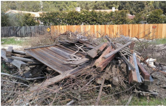
Flood Debris on MPRPD Property