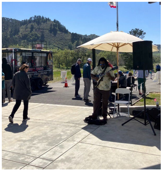
Music and Food