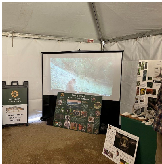
Wildlife Cam Footage