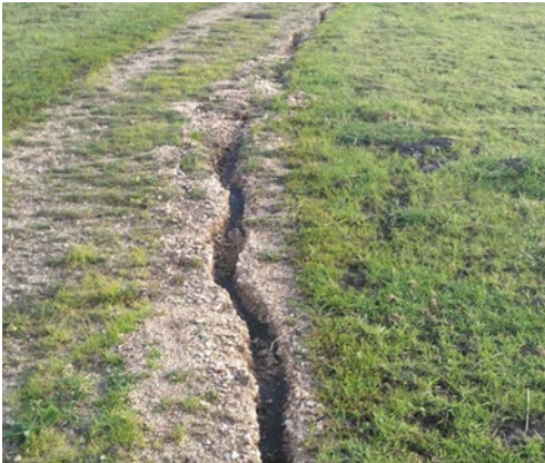
“Channeling” on Barn Trail

Rangers are getting caught up on addressing storm damage that (at the time) was not significantly impacting public safety and/or access during the winter months. Many of these items, such as erosion along Barn Trail at PCRP (see below), were documented and monitored but not addressed immediately, with the understanding we would revisit these items once weather was cooperative and soil conditions were favorable. Rangers will continue to address these items prior to fully transitioning into mowing and brushing of MPRPD's trails and roadways, as soil is presently in prime condition for trail work and reconstruction.