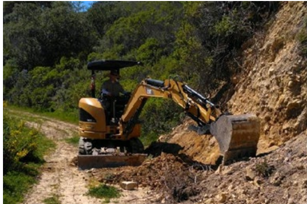
Slides on Palo Corona Trail