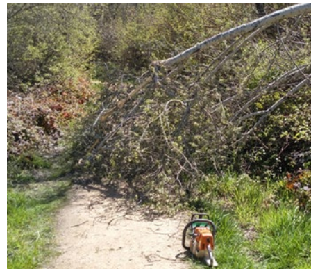
Downed Tree on Lupine Loop