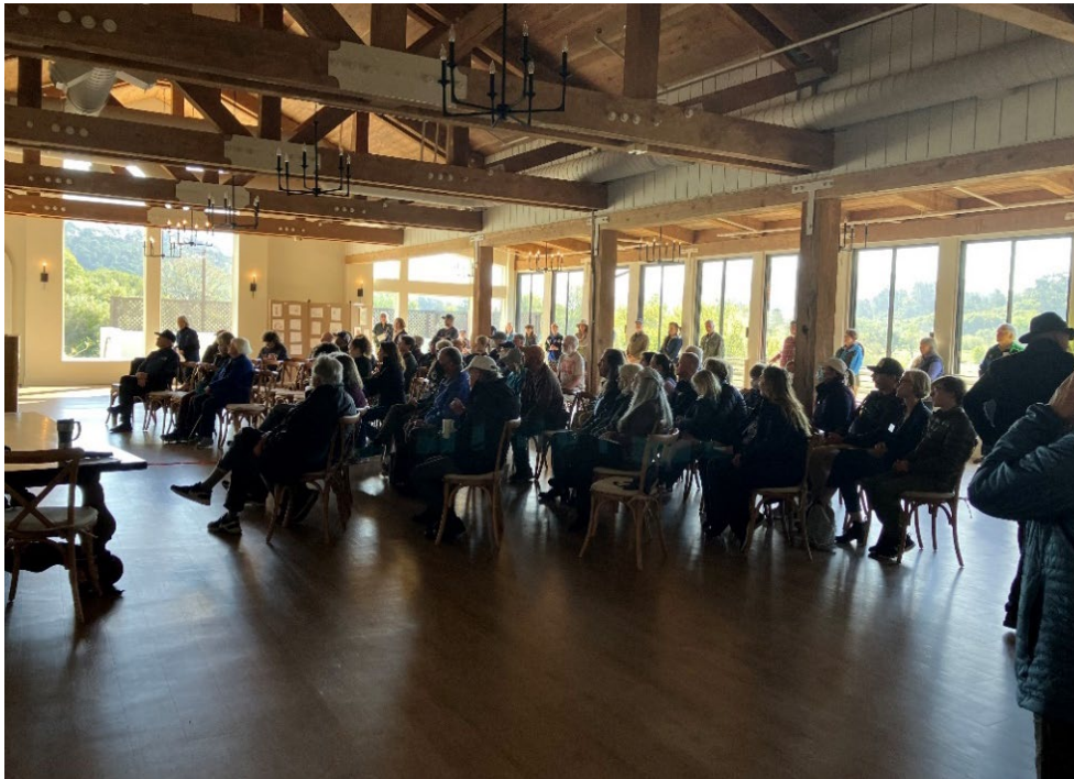
Carmel River Watershed Conservancy's Welcome included Speakers and Panelists