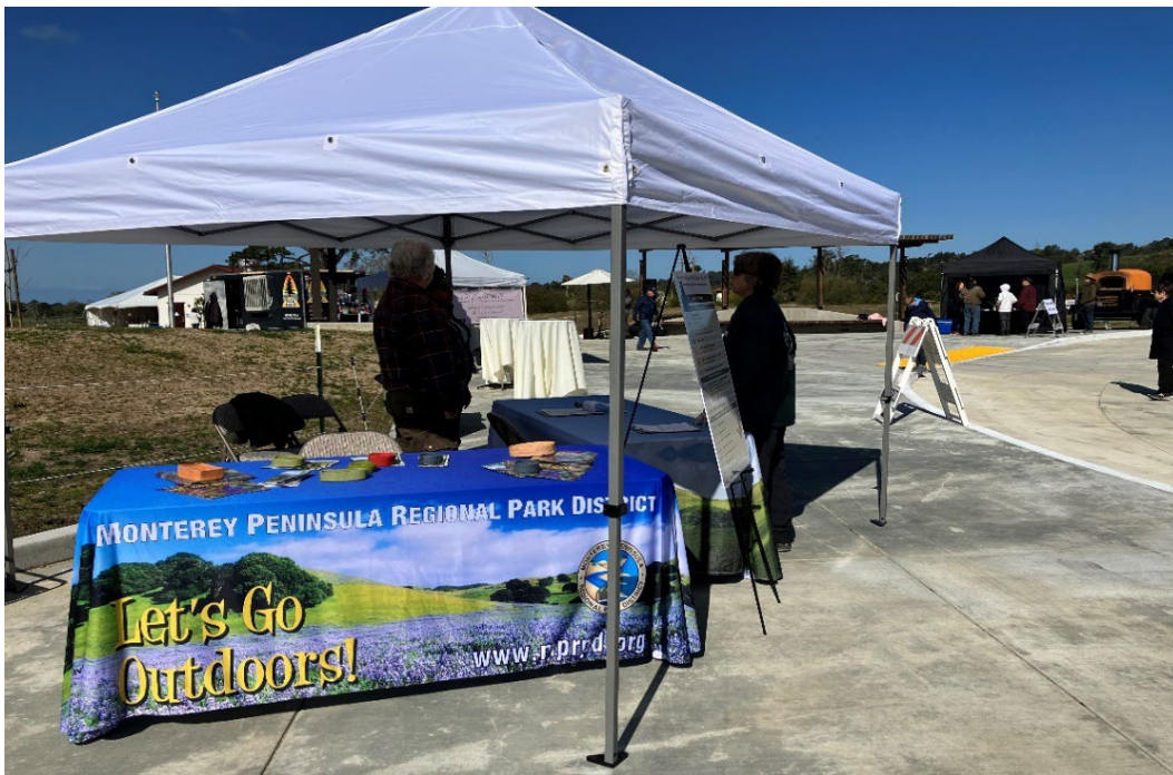
Welcome Booth at the Entrance Plaza