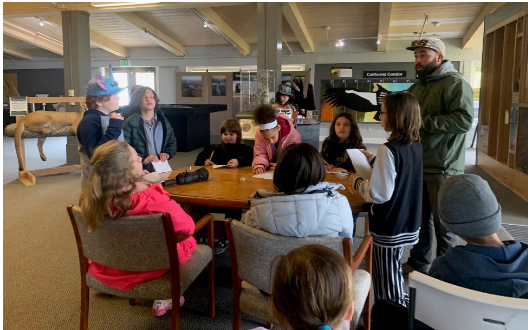
MBCS students share information, reviewing answers to scavenger hunt questions highlighting each of the Discovery Center exhibits

Monterey Bay Charter School (MBCS) students, grades 1, 7, and 8, were delighted by an impromptu visit to the PCRPD Discovery Center (DC). The older students completed a bingo-style scavenger hunt connected with the DC exhibits, while the first graders learned about the local mammals of the area by exploring MPPRD's skin and pelt collection. As a result of this enriching visit, staff were able to forge a new educational connection with this local school's faculty.