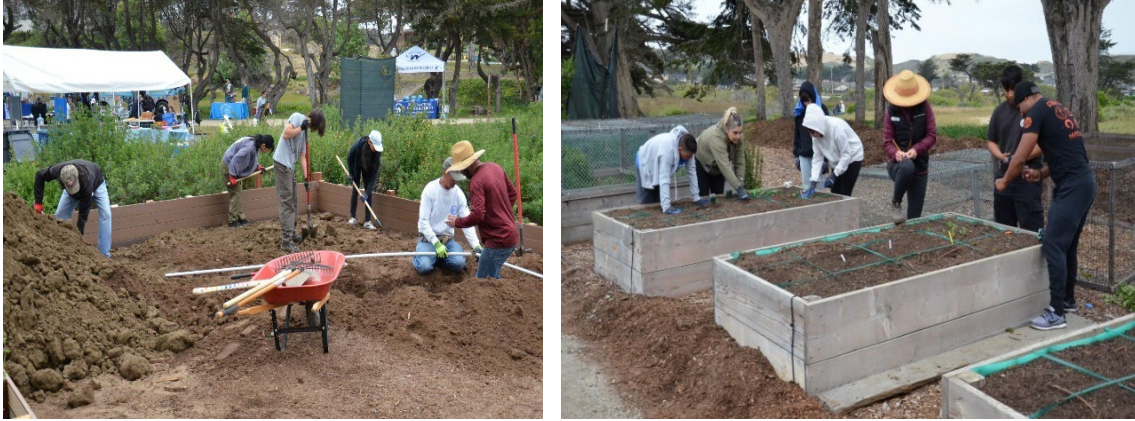
Volunteers Trench Water Lines, Construct Decomposed Granite Paths and Raised Vegetable Garden Beds