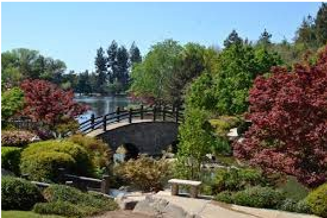
Shinzen Friendship Garden, Fresno, CA

This garden will celebrate the United States’ ethnic and racial diversity, commemorate the many contributions made by this nation’s Asian citizens, and memorialize the many struggles people of Asian ancestry have suffered and overcome, including the Chinese Exclusion Act of 1882, Executive Order 9066’s internment of approximately 120,000 Japanese-Americans and Japanese nationals from 1942 to 1944/45, etc. The garden will also make this park a regional destination and tourism/cultural education-based economic driver for the City of Marina and surrounds.