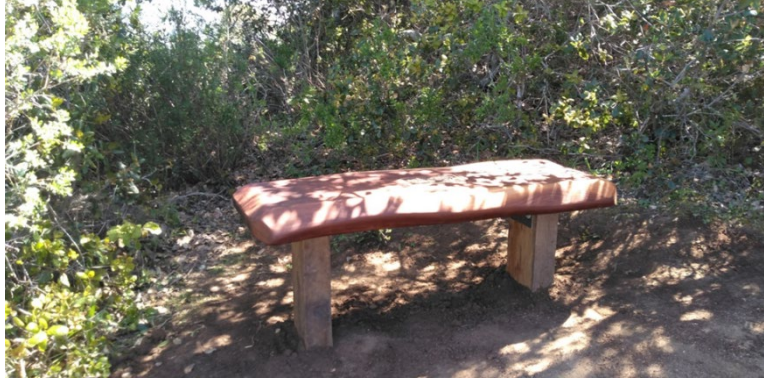
New Memorial Bench on Veeder Trail