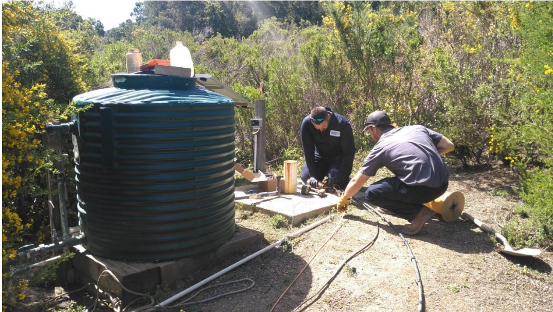
Dougherty's Technicians Working on Mesa Well Pump

drinking water to visitors, canines, and equines at the Mesa, a major destination within GRRP.