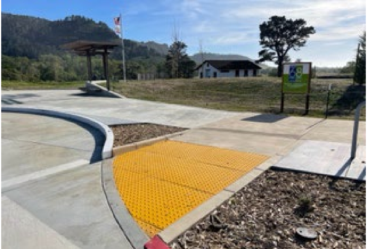
Grantor acknowledgement sign installed at Project B entrance (pedestrian view)