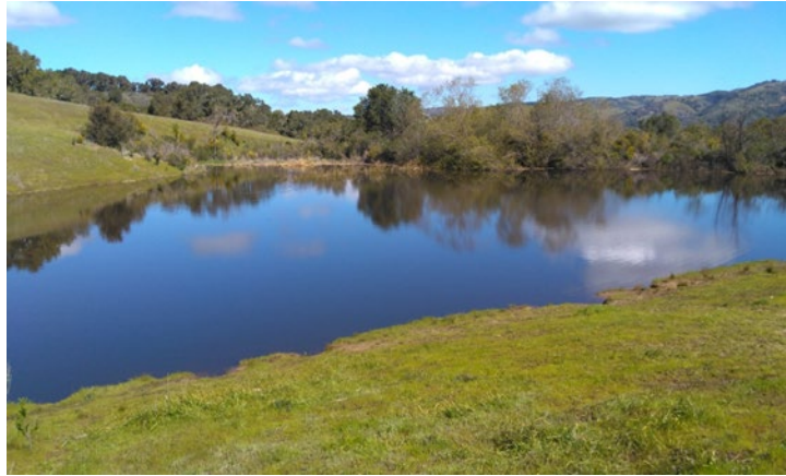
Mesa Pond at Full Capacity