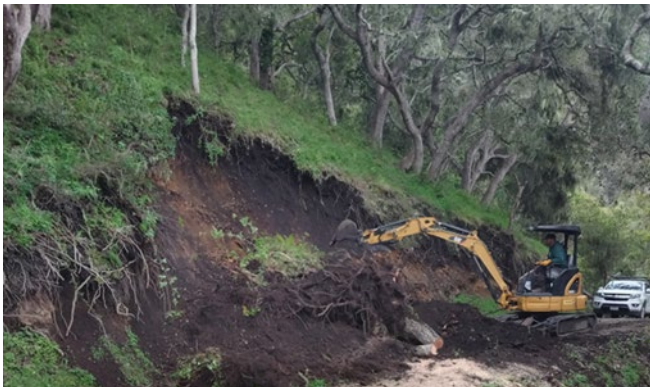
Rangers Removing Fallen Tree at PCRPD

Significant soil saturation on MPRPD property continues to contribute to an increase in fallen trees and erosion, such as this large fallen oak tree at Palo Corona Regional Park, and this fallen Willow tree on Lupine Loop at Garland Ranch Regional Park. The tree at PCRPD required use of MPRPD’s excavator to remove the downed tree and displaced soil.