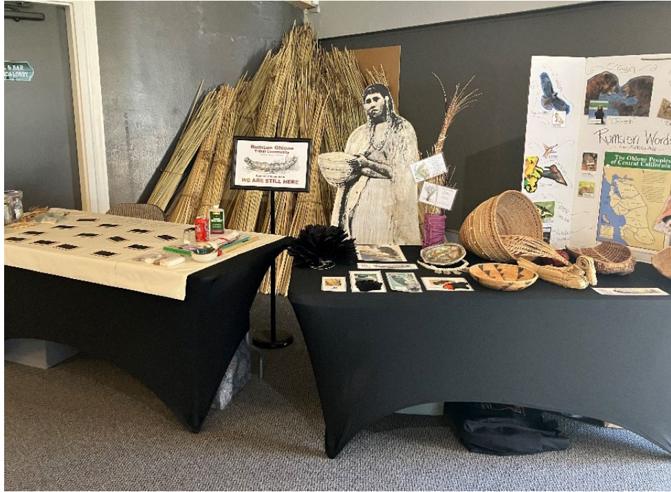
Rumsen Representatives and MPRPD Volunteers and Staff Showcased Exhibits