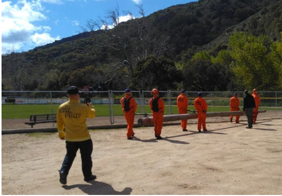
Gabilan Crew Moving Bollards