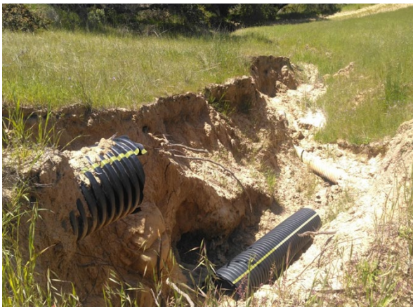
Collapsed and Undermined culvert

An adjuster from Sedgwick Insurance (an underwriter for the Joint Powers Insurance Authority) visited MPRPD on April 19 to inspect damage and assess losses suffered during the storm and flood events of January 2023. OPS staff facilitated this full day's site visits, which included the Palo Corona backcountry, Dedampierre Ballfields, and San Clemente Blue Rock Open Space. Sedgwick's findings will determine if MPRPD needs to move forward with a FEMA claim for damages & cost recovery.