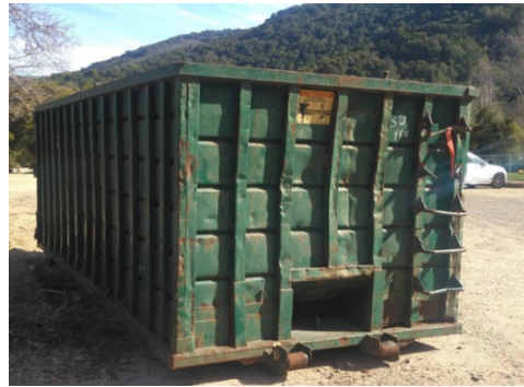
Dumpster Provided by County