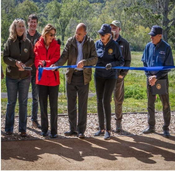
Project-B Ribbon Cutting