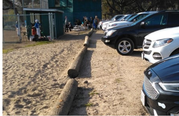
Parking Bollards in Place