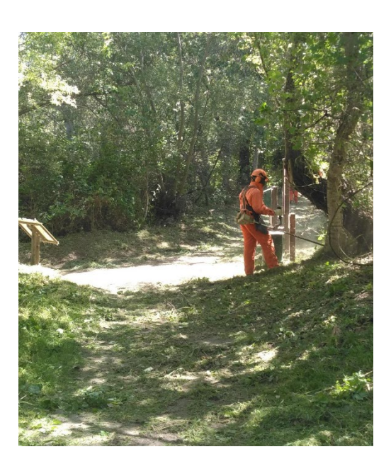
Cal Fire Inmate Crew Member brushing GRRP VC Trail