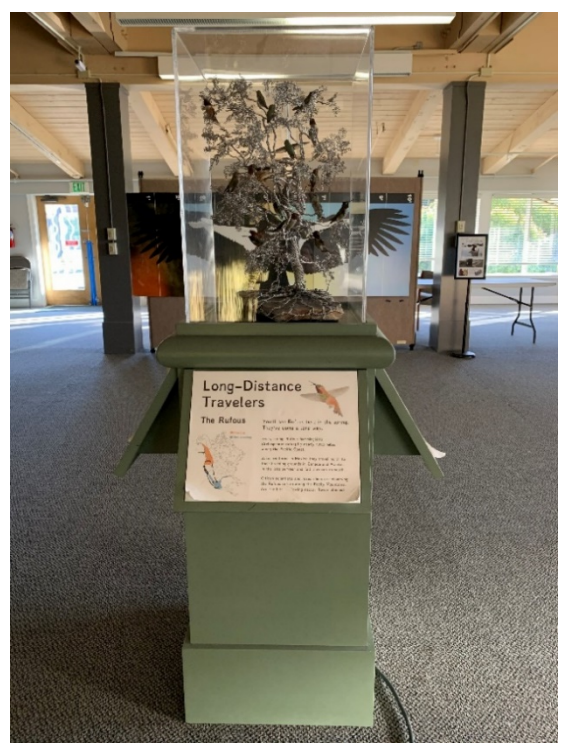
Hummingbird exhibit on permanent loan courtesy of the Pacific Grove Museum of Natural History