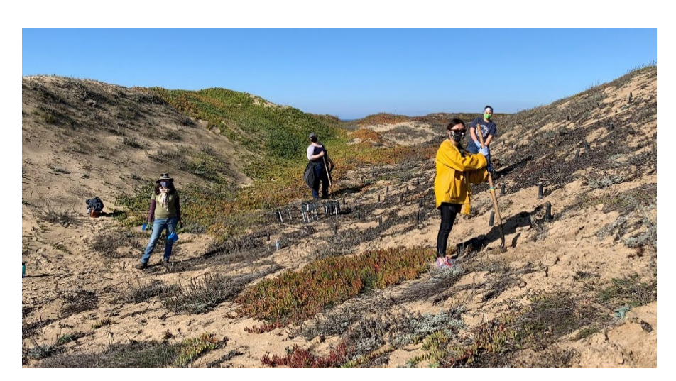
CSUMB's Return of the Native Staff and Service Learners restore areas of the Marina Dunes Preserve foredunes on January 23, 2021