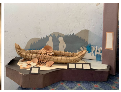
Ruk Concept Schematics