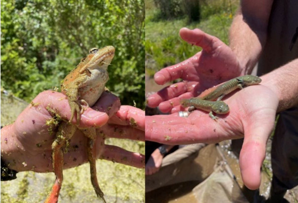
Figure 4: California Red-Legged frog (left) and California Tiger Salamanders (right) found during pond surveys.

6. Staff training: Central Coast Prescribed Burn Association Training Exchange “TREX”: Update from June staff report. Due to scheduling conflicts, staff were not able to attend a weeklong training focused on fire and fuel management techniques that was hosted by the Santa Lucia Conservancy in early June.