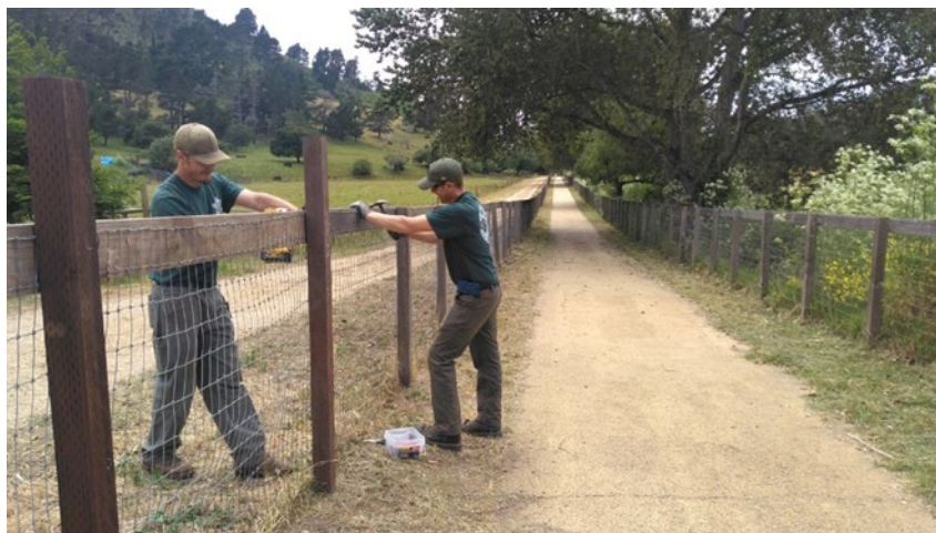
Rangers Hatton and Ira repairing Southbank Trail fence

Ranger staff repaired a section of the Southbank Trail fence recently that began to lean due to multiple broken posts. The materials used originally to construct this fence were untreated, which leads to premature failure. Staff may need to replace this entire fence in the future, based on discussions regarding the trail's alignment.