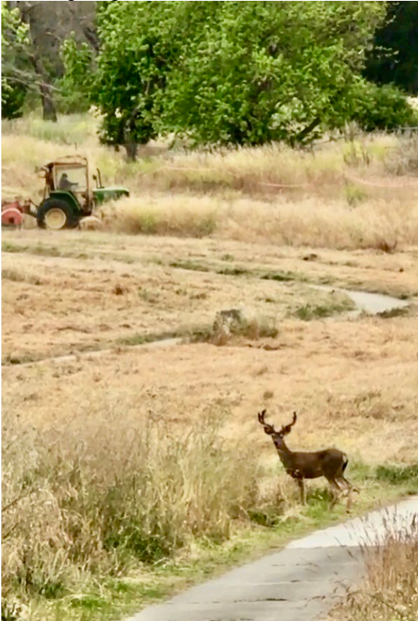
Mowing near Admin Headquarters