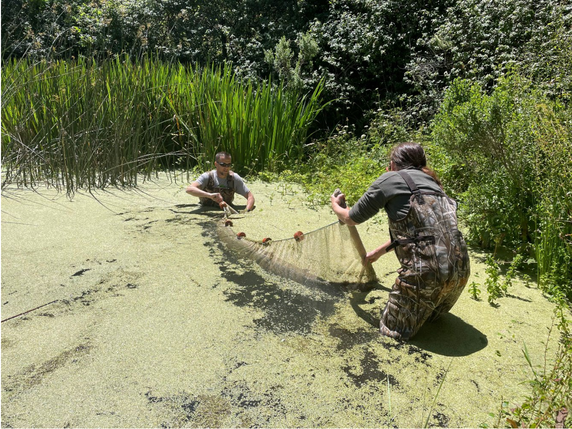
Figure 3: Seine netting surveys at Animas Pond.