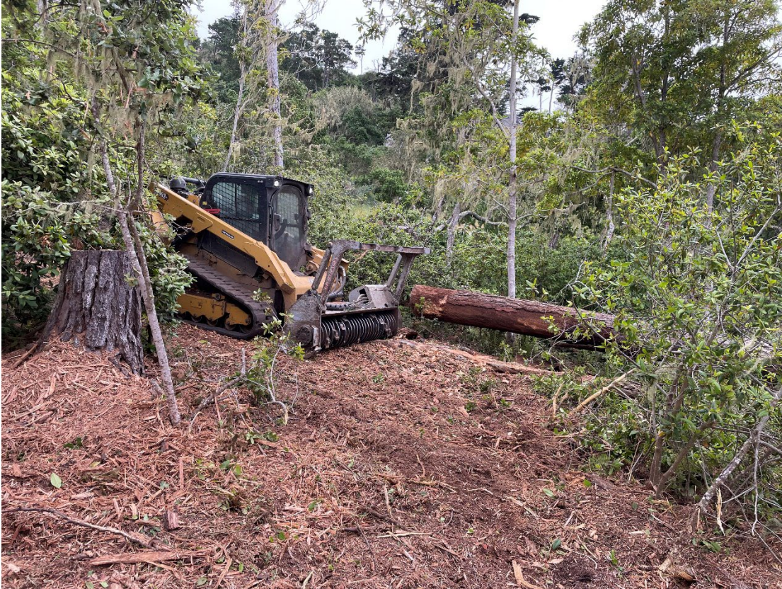
Figure 2: Chipping of downed logs and ladder fuels to restore more natural levels of downed wood and vegetation density.