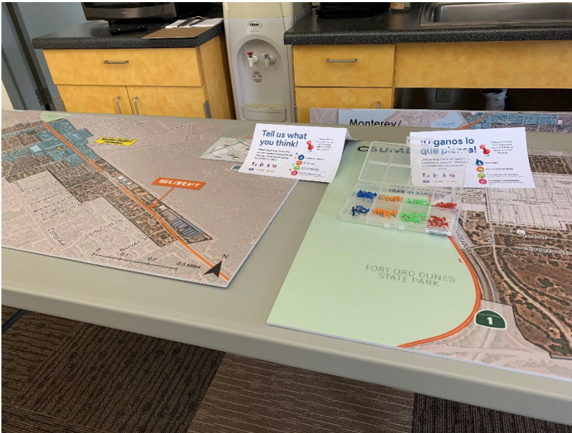
MST staff provide an opportunity for the public to comment on the SURF! project.