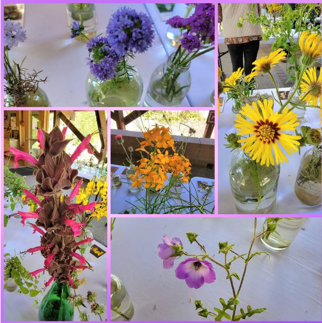
Wildflower Show visitors experienced a diverse array of blooms and colors from MPRPD parklands.