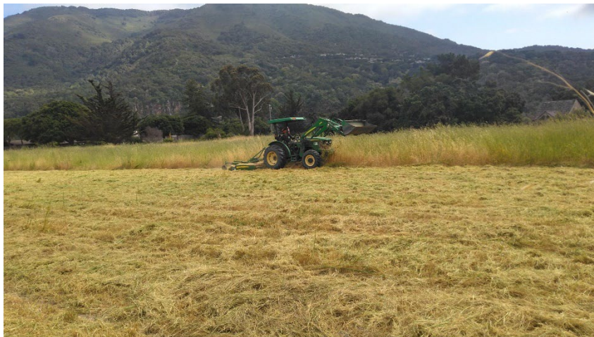
Ranger staff mowing Thomas Open Space

Ranger staff recently mowed Thomas Open Space in Carmel Valley. This project was completed using the District's tractor and rotary deck mower. Ranger staff will continue to monitor growth at this property to determine if it needs to be mowed a second time this season.