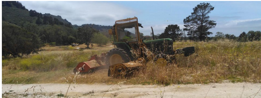
Ventana Forestry mowing RCU

Mowing of the Rancho Canada Unit has taken longer than in prior years due to the requirement to observe bird nesting season. AMMs (Avoidance and Minimization Measures) were developed and are being followed during the project. A licensed biologist is required to be onsite during much of this project to survey for bird nests and monitor for CRLF (California Red-legged Frogs).