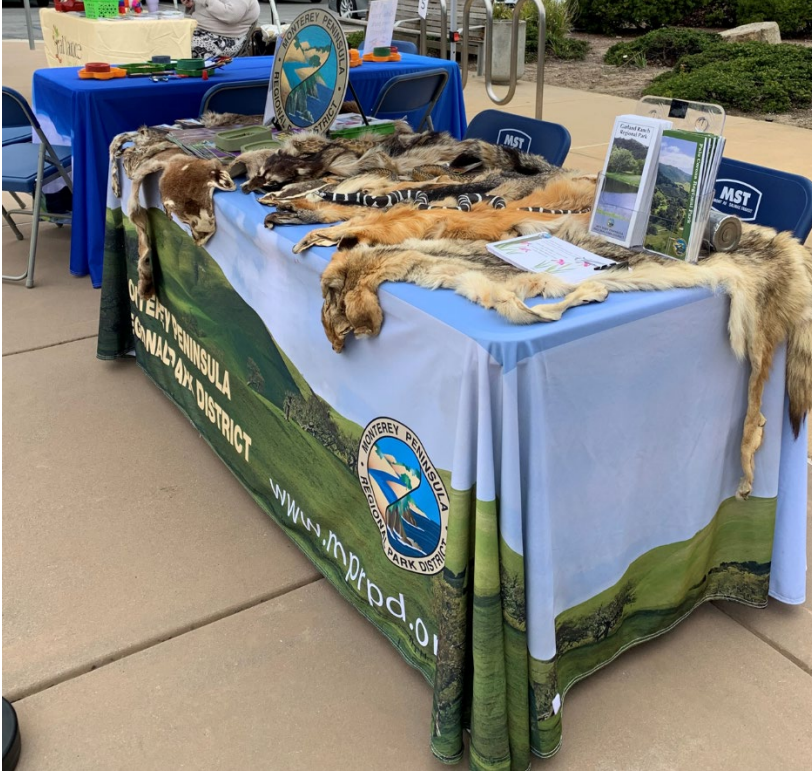
On display are the common animals found along the peninsula.