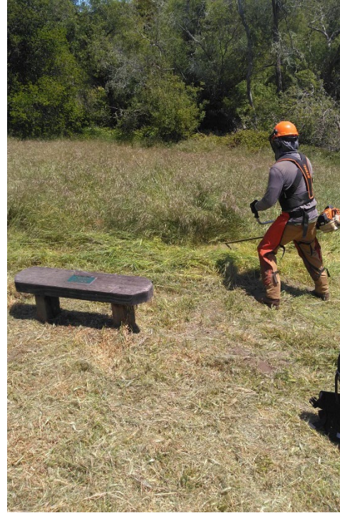
People Ready workers using weed-whip and DR mower