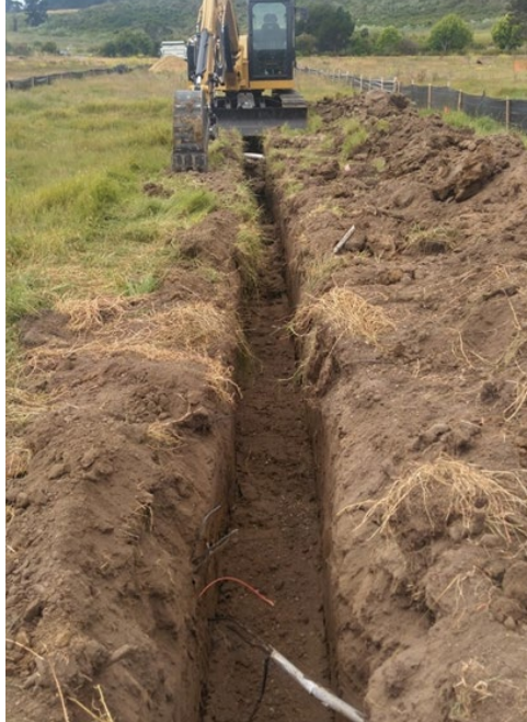
PG&E Trench at RCU Entrance