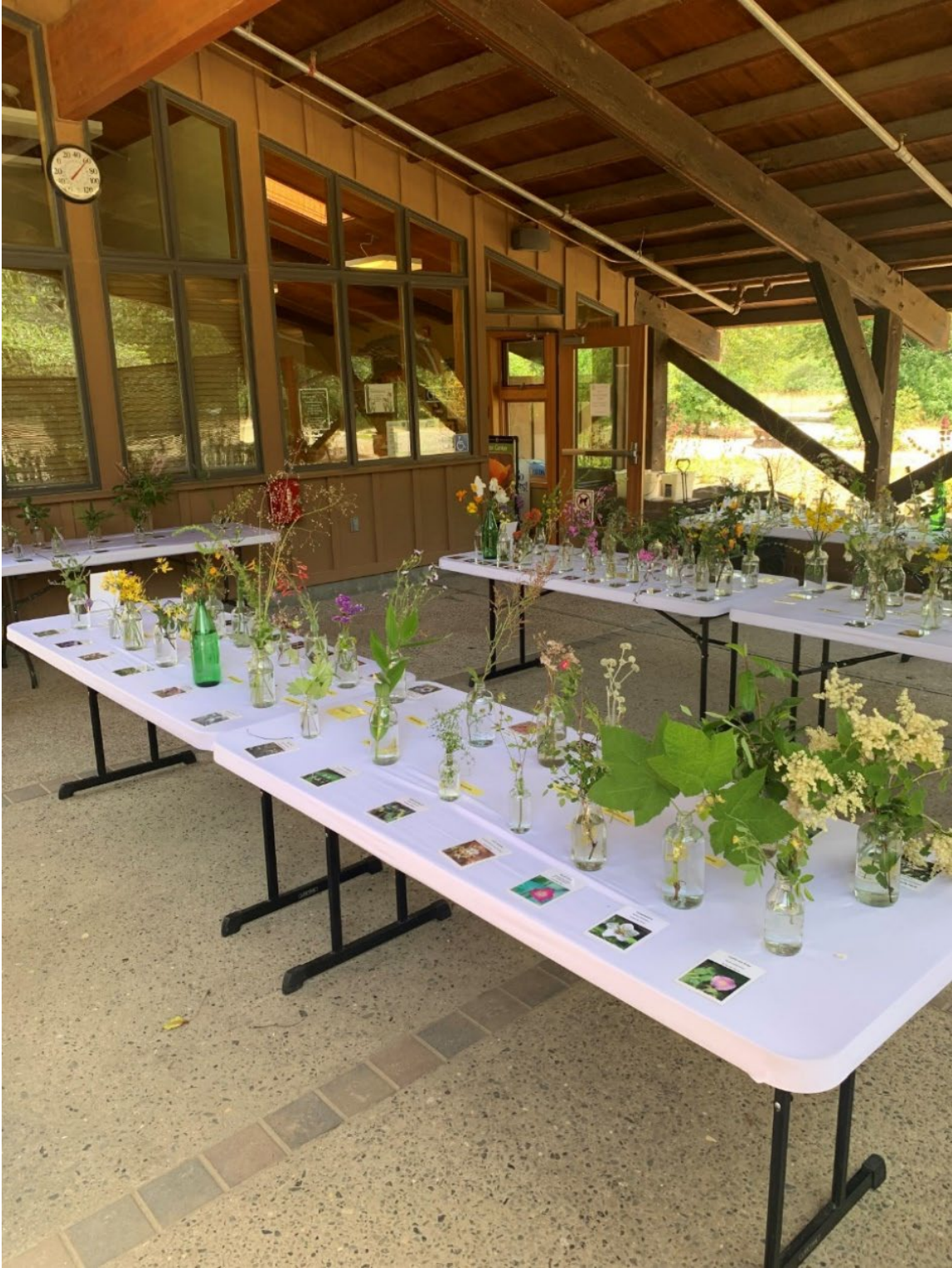
Wildflowers are on display at the Garland Visitor Center Patio during the second week of June.