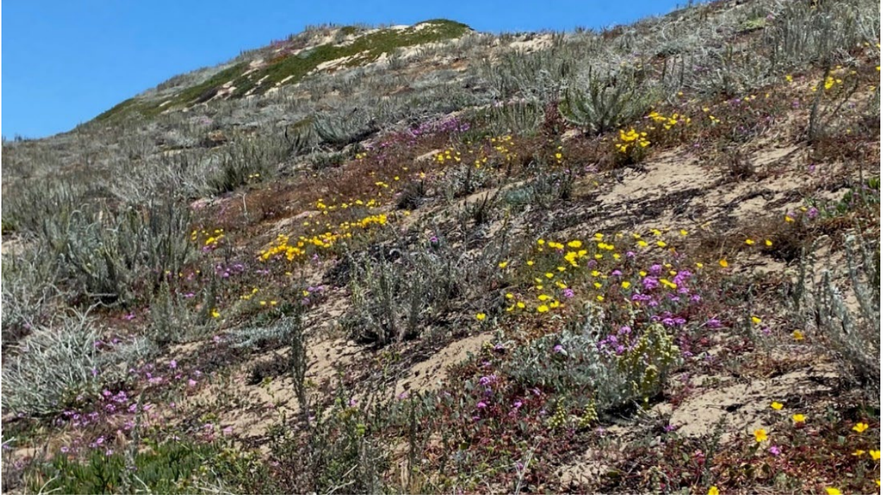
Wildflowers in Marina Dune Preserve as staff prepares to collect specimens for the annual wildflower show..