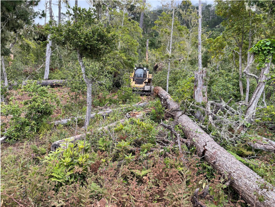
Figure 1: Mastication equipment beginning fuels reduction work.

3. Laidlaw-Apte Vegetation Management Project: Vegetation and fuels reduction work at the Property began on June 14 and, as of writing this report, is expected to be completed by the end of June. Staff have been actively monitoring the work and coordinating with Cal Fire, and the Carmel Highlands Fire Protection District, the consulting forester and equipment operator, and surrounding residents during the course of the project. The project is expected to restore the health of the forest on the property while also reducing the risk of catastrophic wildfire. (Figure 1 and 2)