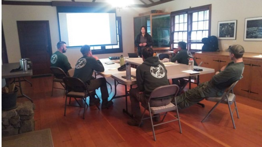
Ranger staff attends training at GRRP

Members of the Ranger staff also attended a tailgate training provided by the District's contracted Biologist to aid personnel in recognizing special status resources that may occur in mowing areas. This training included identification of sensitive species and habitats, a description of the regulatory status and general ecological characteristics of sensitive resources, and review of the limits of construction and best management practices required to reduce impacts to biological resources within the Rancho Canada Unit.