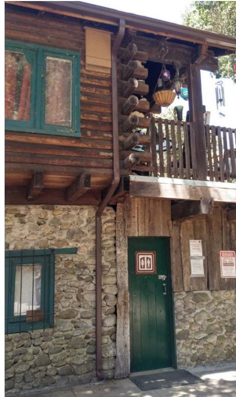
The new Cachagua Community Center Roof w/ gutters and downspouts