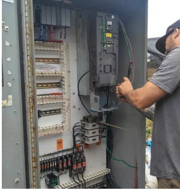
Maggiore Bros. completing pump improvements