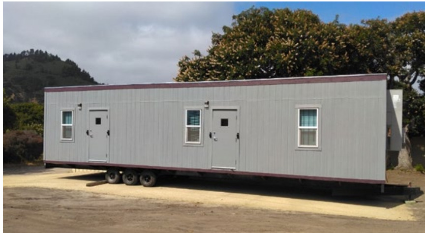
New Ranger Station at Palo Corona Regional Park

The new “temporary” portable office trailer to be used for Ranger staff offices at Palo Corona Regional Park has arrived. It was delivered on June 21 st and will be located east of the Rancho Canada Unit Maintenance Shop. This unit will accommodate 4 additional work stations, copy machines, and a small meeting room.