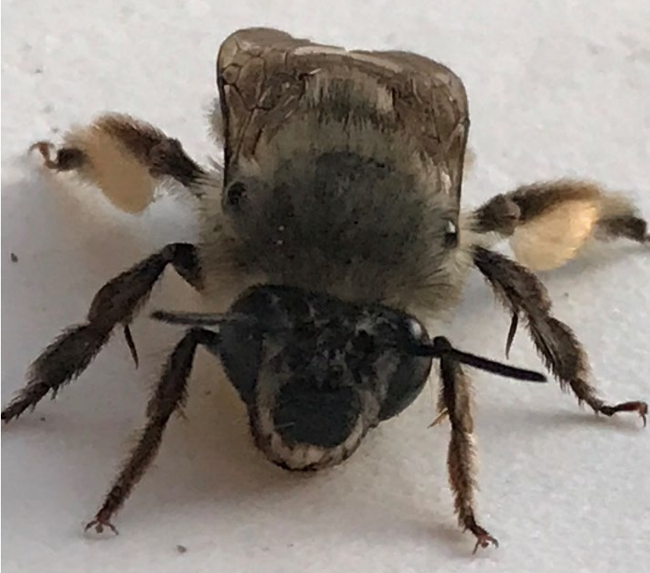
Bumble bee surveyed at Julia Pfeiffer Burns State Park feeding on black sage (Salvia mellifera).