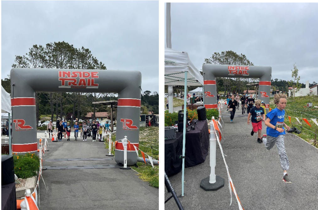
Runners at the Fun Run prepare at the start line and finish the race with enthusiasm.

PCR. Four routes were offered, from an 8.5-mile, one-way course from Williams Canyon, a 9.5-mile to Ishxenta State Park and back, a 21-mile Adventure Course to Mitteldorf and back, and a 2-mile Fun Run. The BSLT was able to raise $3,060 out of $10,000 at the event.