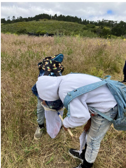
Images: Bug collection & identification by Bay View Academy 5th graders on May 11th, 2023. Part of Phase 2 of the Healthy Habitats pilot program.