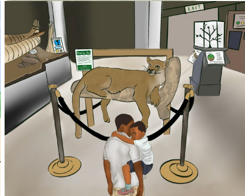
CSUMB Servicer Learners graphic design pieces for the Visitor Experience Interpretive Plan