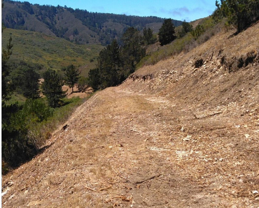
Palo Corona/Quail Meadows Fuel Break - South