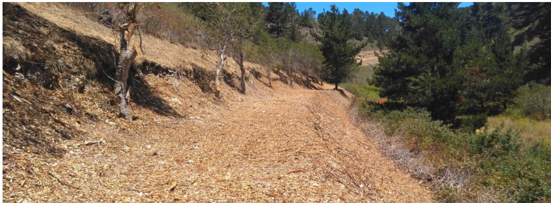
Palo Corona/Quail Meadows Fuel Break – North