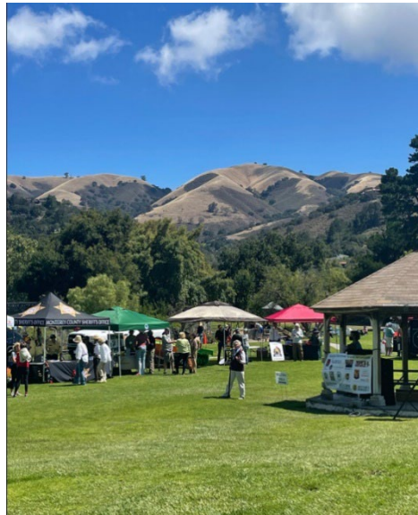
Booths at Wildfire Preparedness Fair

Staff continues to meet monthly with community members of the Fire Mitigation Committee Meeting. Working cross-divisionally, the community members are highly motivated to see the development of a Fuels and Invasive Species Removal Volunteer Program that shall be led by the EECO and OPS divisions.