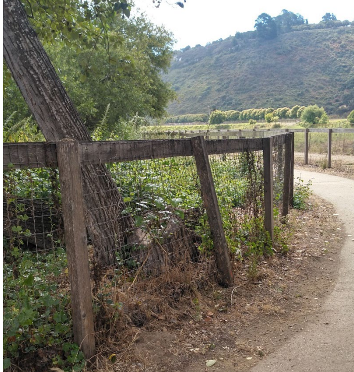
Southbank Trail Fence - North