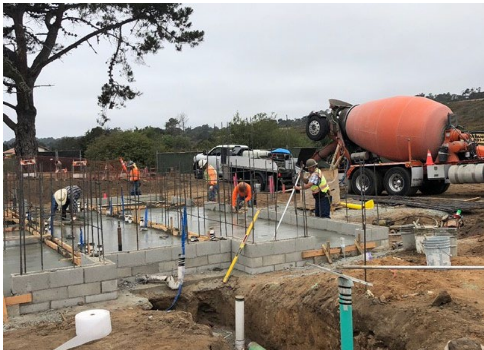
Restroom Building's Concrete Foundation Placement