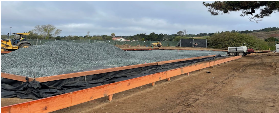
Multipurpose Event Pad Foundation Under Construction

The site's construction-related directional signage has been highly effective in navigating our visitors throughout the park site. Public feedback has been positive.