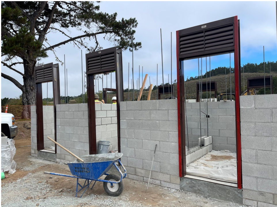
Restroom Building's Walls and Door Frames Installation