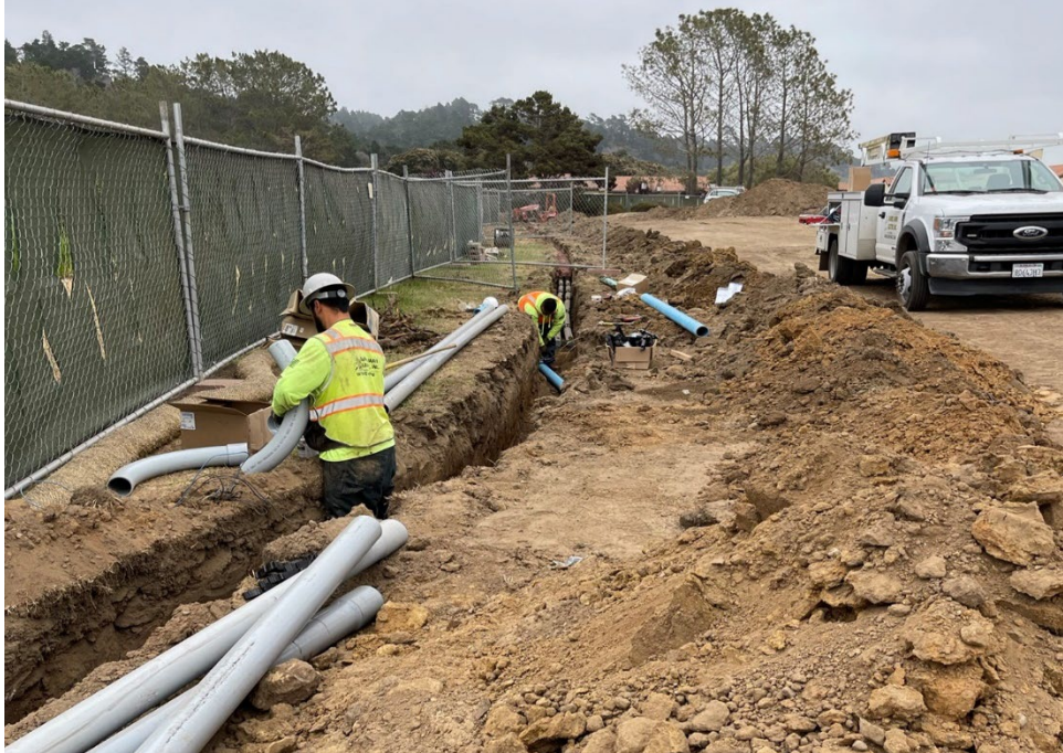
Site Utilities' Installation