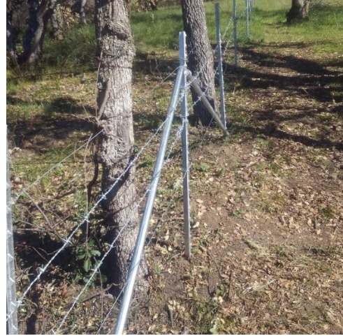
New sections of fence erected at San Clemente – Blue Rock Property