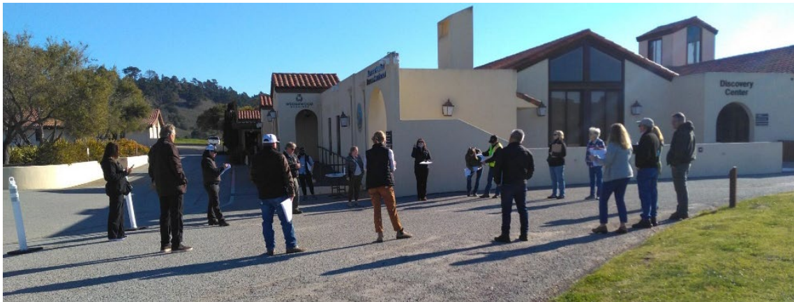
Prospective bidders at the mandatory Project B pre-bid meeting