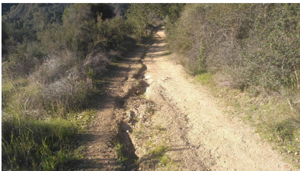
East Ridge Trail – Before