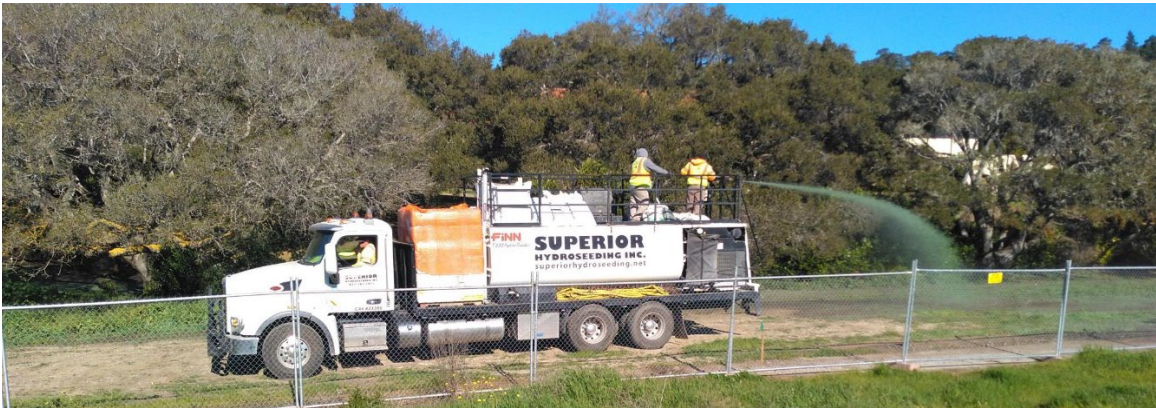
Disturbed areas being hydroseeded