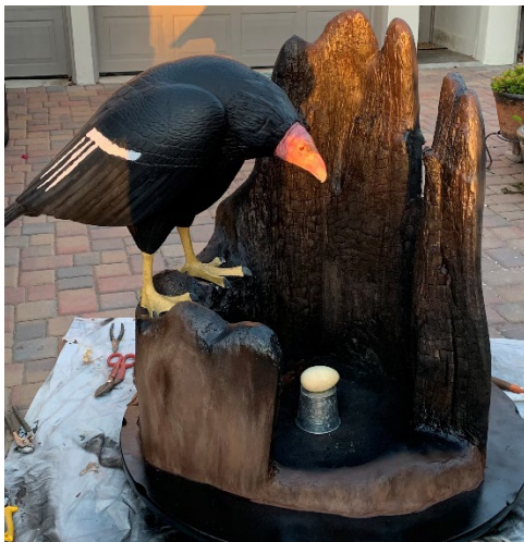
California Condor Redwood Nest Exhibit (at 80%)