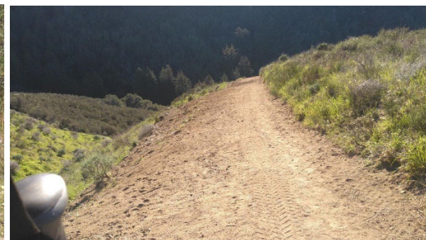
East Ridge Trail – After