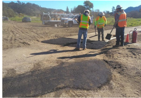
Graniterock Construction Company patching asphalt trails