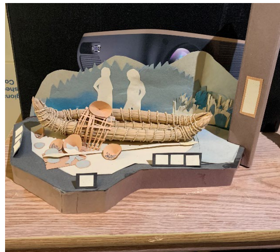
Rumsen Tule Boat and Fishing Tools Exhibit (concept model)