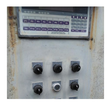
Existing RCU Irrigation Panel

Rangers continues to work with Avila Construction (Project-B's contractor), BFS Landscape Architects, and Maggiora Brothers to diagnose, repair, and program the existing irrigation infrastructure at Rancho Canada. This existing infrastructure will be connected to new Project-B irrigation infrastructure to create a single, automated, programmable irrigation system.