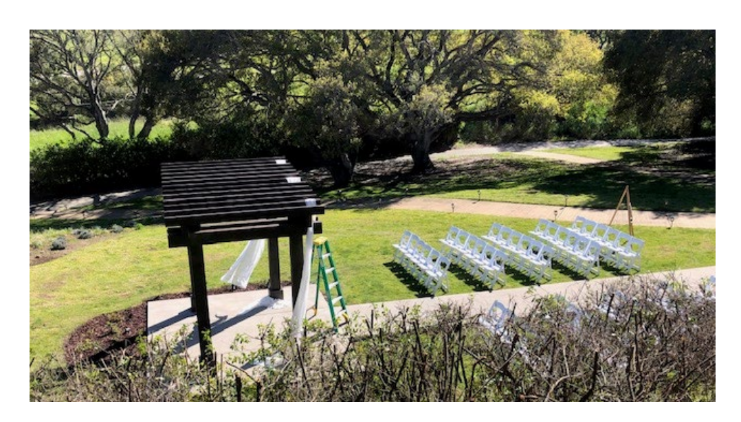
New wedding lawn arbor

MPRPD's concessionaire, Wedgwood Weddings and Banquets, continued implementation of several substantial improvements for the event venue. These improvements' substantial costs are being underwritten by the concessionaire. The updated and upgraded facilities shall continue to be available for MPRPD's functions as well.