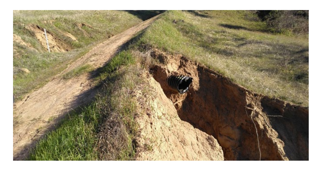
San Clemente-Blue Rock erosion caused by culvert drainage