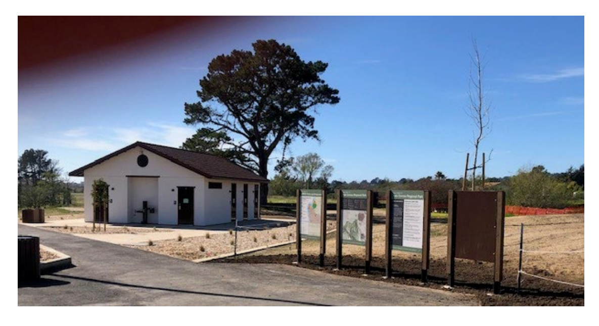
New kiosk signage installed (ward boundaries, map, rules, bulletin board)