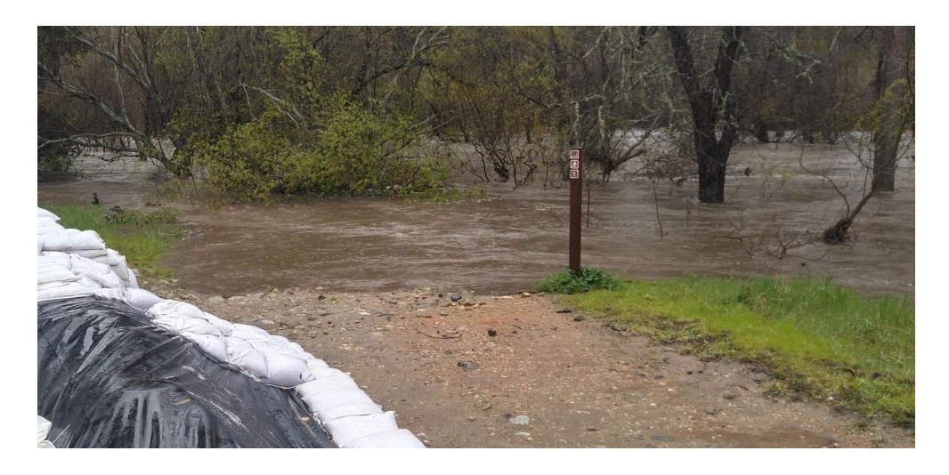
Carmel River on March 10 @ Dedampierre Park

As anticipated, Mother Nature was not finished following the series of atmospheric river events that pummeled the Central Coast during the month of January, which significantly impacted District parks, preserves, and infrastructure. On March 10, an atmospheric river event caused the Carmel River to come within a few feet of the sandbag retaining wall.