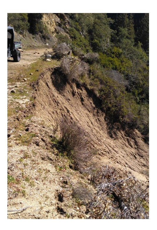
Undermined road in PCRP Backcountry