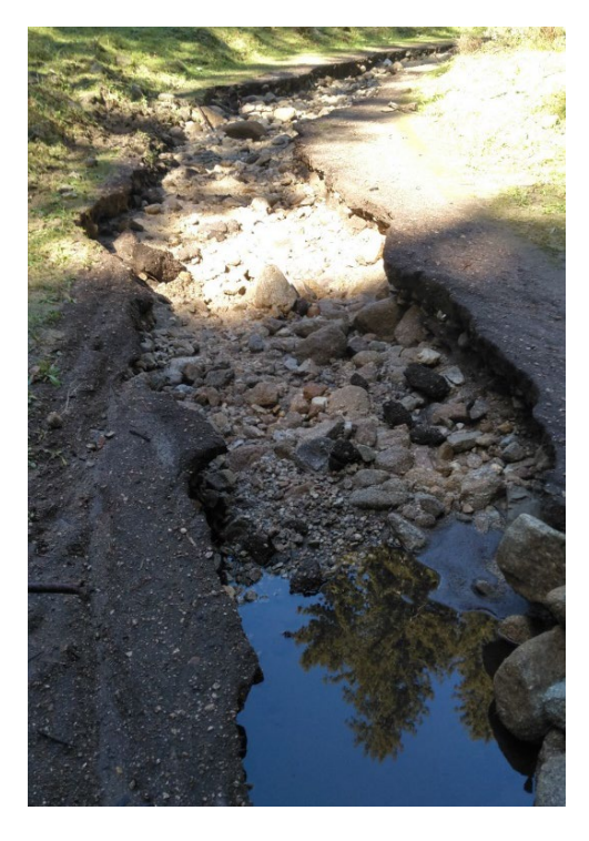
Road damage along PC Trail

contract with equipment operators to affect those repairs that require specialized equipment. Those repairs that require hiring a specialized equipment contractor include Palo Corona's backcountry road repairs and mitigation project, DeDampierre Ballfields parking lot resurfacing project, and the San Clemente Blue Rock Open Space road repair and debris removal project.