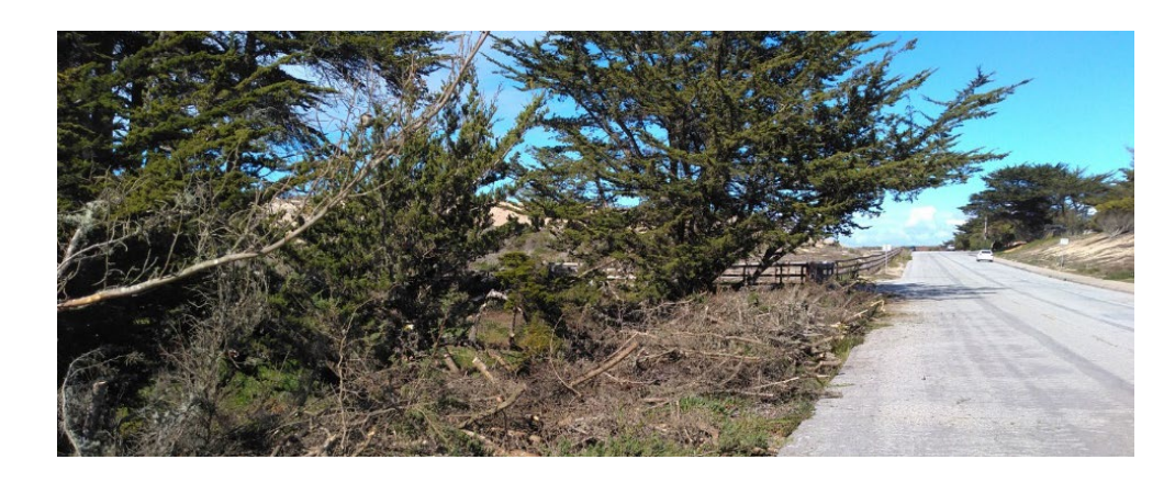
Cypress brush staged along Dunes Drive to be chipped