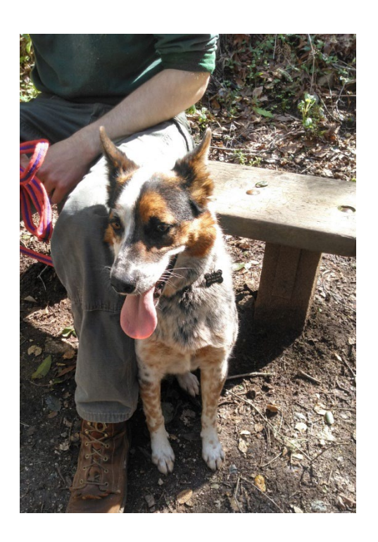
Lost dog reunited with owner