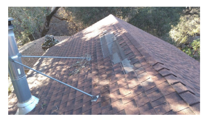
CCC Apartment Roof Damage

The small apartment's roof suffered additional damage as a result of January and March wind events. Staff initiated the project on Procure Now, and conducted a mandatory site visit for interested contractors on March 2. Proposals have been submitted and the District is in the process of selecting the most responsive contractor. This project will provide a significant increase in the park's resiliency against extreme conditions during the hot summer days and cold winter nights, and will include the installation of rain gutters and downspouts. This project is being coordinated by Rangers, with assistance from RGS Consultants and Admin staff.