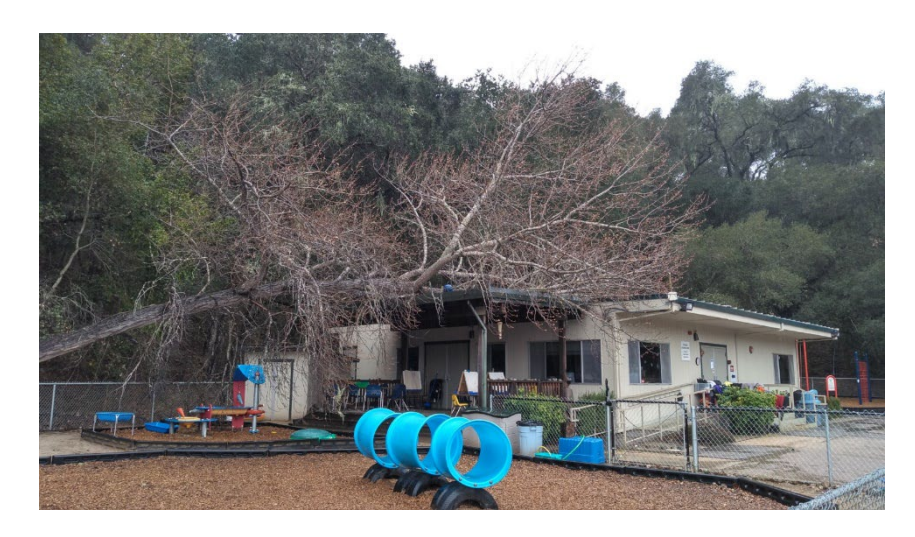
Tree down on CUSD Classroom

A large Maple tree recently fell onto the Carmel Unified School District (CUSD) classroom located at Cachagua Community Park. Fortunately, the tree did not fall with enough force to significantly damage the building. CUSD staff assessed the building, then hired a tree service contractor to remove the tree and haul the debris.