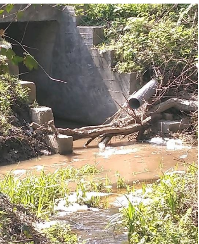
Flooded FPWP Trailhead