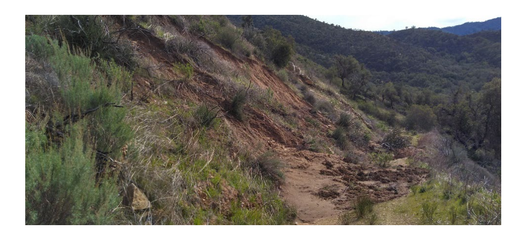
San Clemente Blue Rock road slide

When there was a break in the weather, Rangers moved quickly to address those items that were of greatest threat or benefit to the public, including removal of downed trees, parking lot repairs, and reuniting lost pets with their owners.