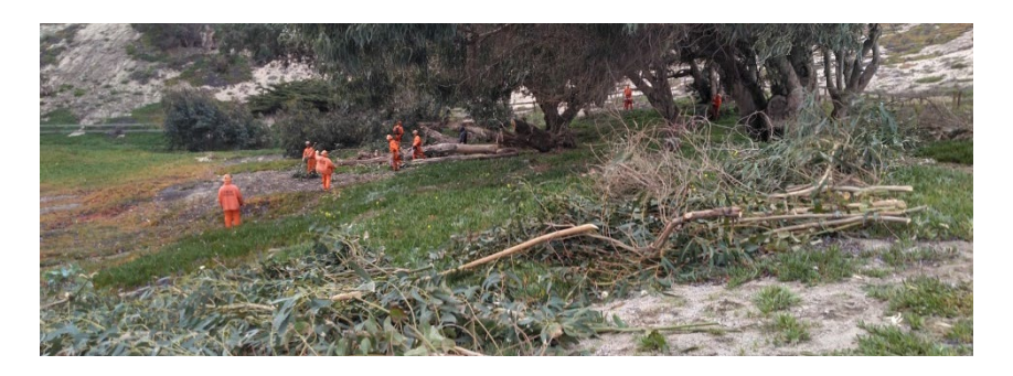
Gabilan Crew highlimbing eucalyptus trees at MDP

Gabilan Conservation Camp inmate crews spent two days at the Marina Dunes Preserve's (MDP) south entrance high limbing trees and chipping brush to address the recent increase in homeless activity at this site. Rangers also removed surplus lumber, kiosk panels, and fencing from the restoration site. These materials will be used at other locations.