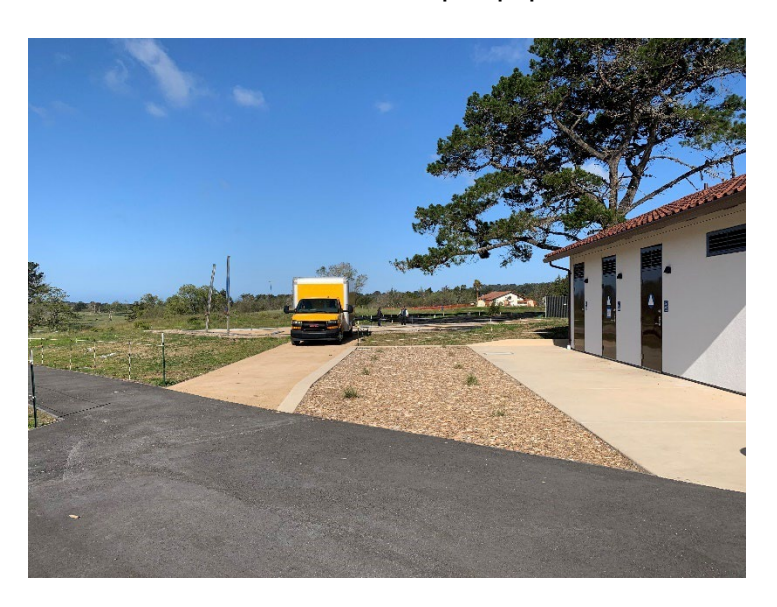
Equipment being dropped-off at Tent Pad

In preparation for the CWD and Grand Opening event, a 40'x80' tent was installed on the newly completed multipurpose pad. The pad was designed to allow large vehicles access to the site to offload and set-up equipment.