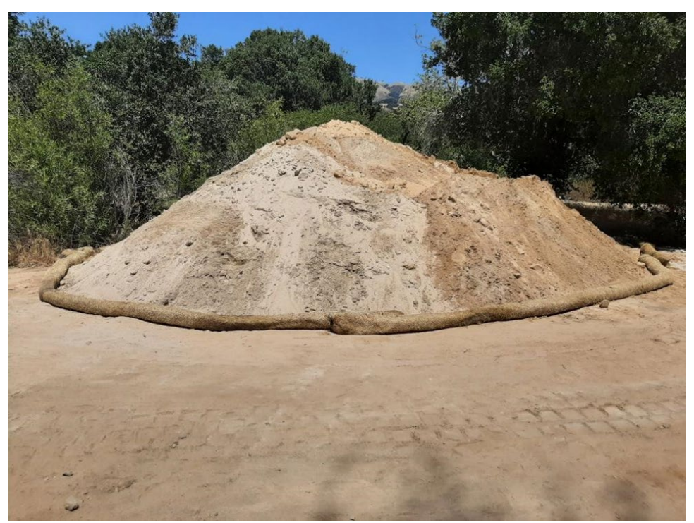
Stockpiled sand for next flood event