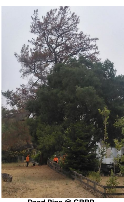
Dead Pine @ GRRP