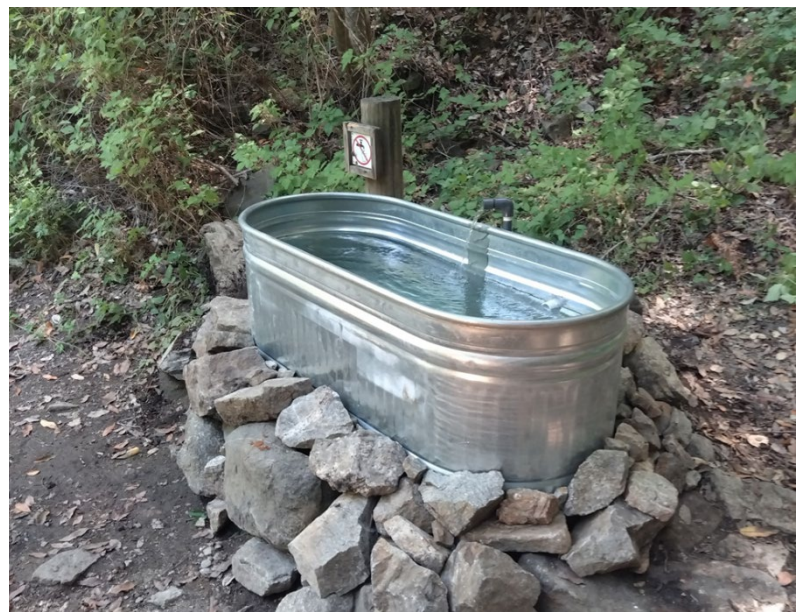
New trough at Fern/Sage Trail Junction

Ranger staff replaced the trough at the junction of Fern and Sage Trails at Garland Ranch Regional Park. The previous trough had developed weep holes which floods the trail and attracts yellow-jackets.