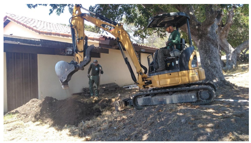
Rangers Jake and Jared dig the trench for electrical service

trench for the electrical conduit to serve the building. This unit will accommodate four additional work stations, copy machines, and a small meeting room.