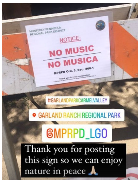
Social media post of additional signage

MPRPD is amidst its peak season for visitation, particularly at Garland Ranch Regional Park, where visitors flock to the Carmel River for relief on hot summer days. As a result, Ranger staff installed signage prohibiting music at designated locations, prompted by multiple complaints of loud music from Bluetooth speakers. Appreciation was expressed on social media for the Rangers' efforts, which also involves very frequent visits to popular river access points to ensure people are abiding by District rules and regulations, especially on weekends.