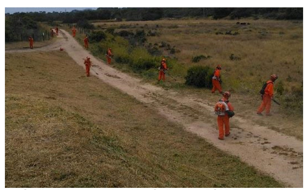
Gabilan inmate crew brushing fuelbreak at PCRP Front Ranch

Ranger staff utilized the Gabilan inmate crew to improve a fuelbreak at Palo Corona Regional Park paralleling the Highway 1 entrance road. A typical inmate crew offers fifteen temporary employees that are capable of operating power equipment at an extremely affordable rate.