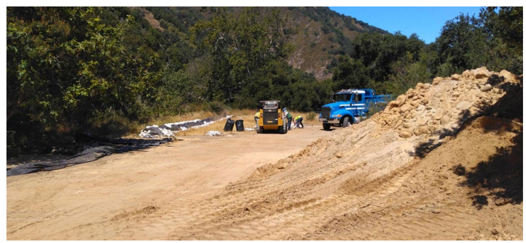
Don Chapin Company removing sandbags at Dedampierre Ballfields

Ranger staff coordinated access for Monterey County Public Works' contractor Don Chapin to remove the temporary sandbag retaining wall along the northern levy of the Carmel River installed prior to winter flooding. The sandbags were emptied and removed, while the sand was stockpiled on site to be utilized in future years.