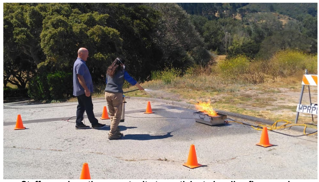
Staff was given the opportunity to participate in a live-fire exercise

Ranger Staff coordinated Fire Extinguisher Training for all MPRPD staff. This training was held at the PCRP Discovery Center and provided free of charge by the District's Insurer, CJPIA.