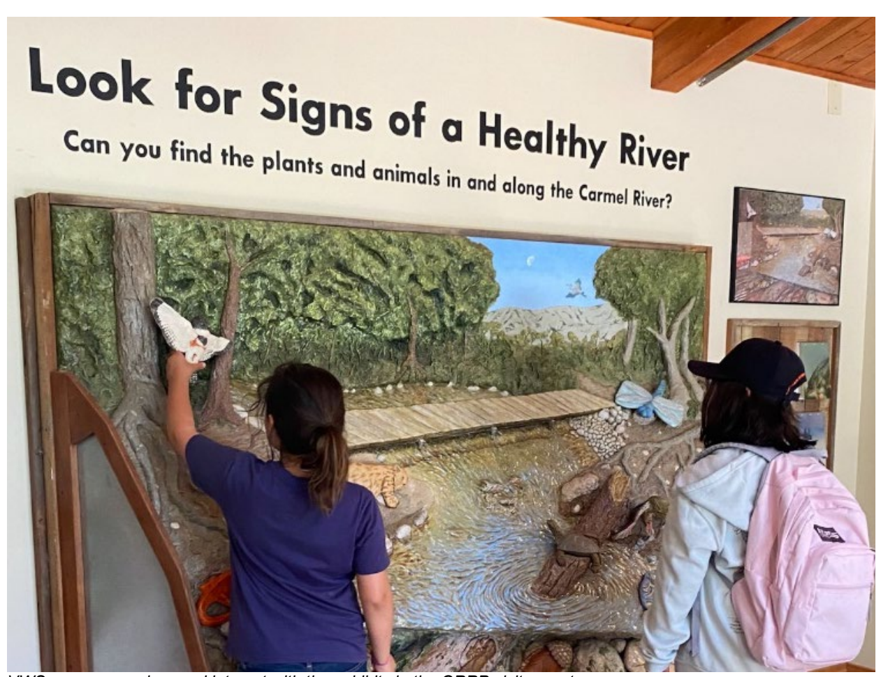
VWS campers explore and interact with the exhibits in the GRRP visitor center.