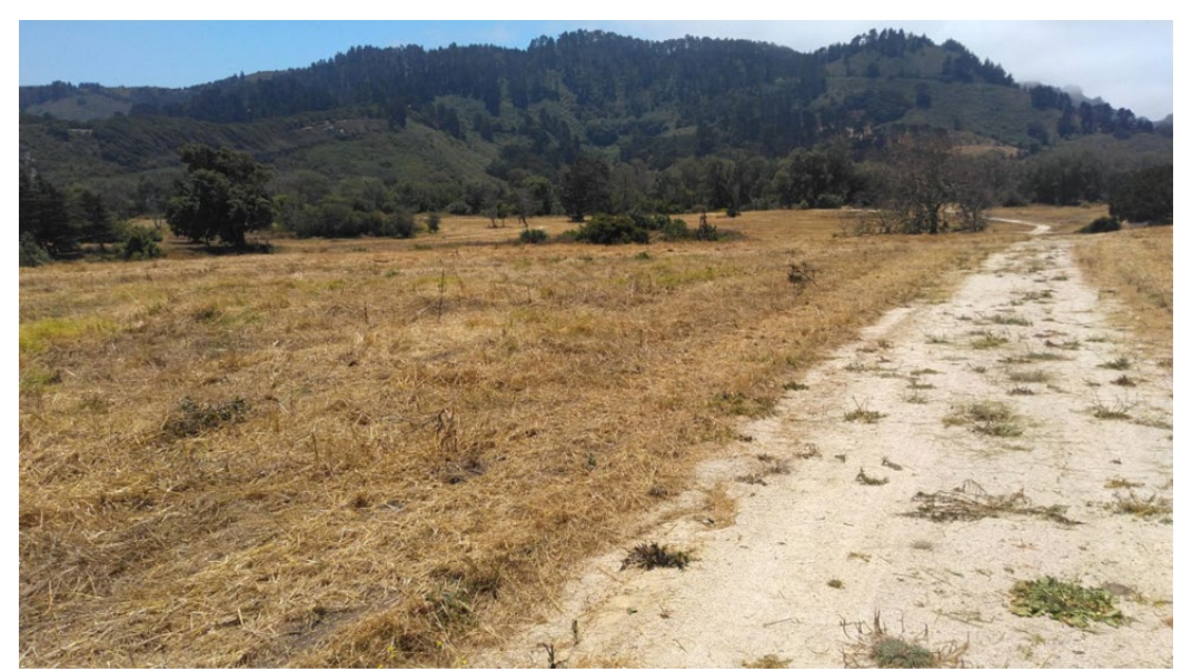
Mowed areas of Rancho Canada Unit

Mowing of the Rancho Cañada Unit has taken longer than in prior years due to the requirement to observe bird nesting season and have a biologist onsite while mowing areas identified as CRLF (California Red-Legged Frog) habitat. The AMMs (Avoidance and Minimization Measures) continue to be followed during the project. Staff met with Cal Fireñññ onsite on July 21 to facilitate a site visit and discuss conditions.