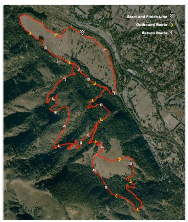
Fiesta Mountain Run Course Map

The Fiesta Mountain Run in Garland Ranch Regional Park is scheduled for August 6, 2023. Ops and EECO staff are finalizing the details on the special use permit to be issued to the event sponsor (Carmel Valley Kiwanis). Again this year, CV Kiwanis were charged a small fee to cover the cost of a District-provided portable toilet at the Mesa, and an MPRPD Ranger dedicated to the event.