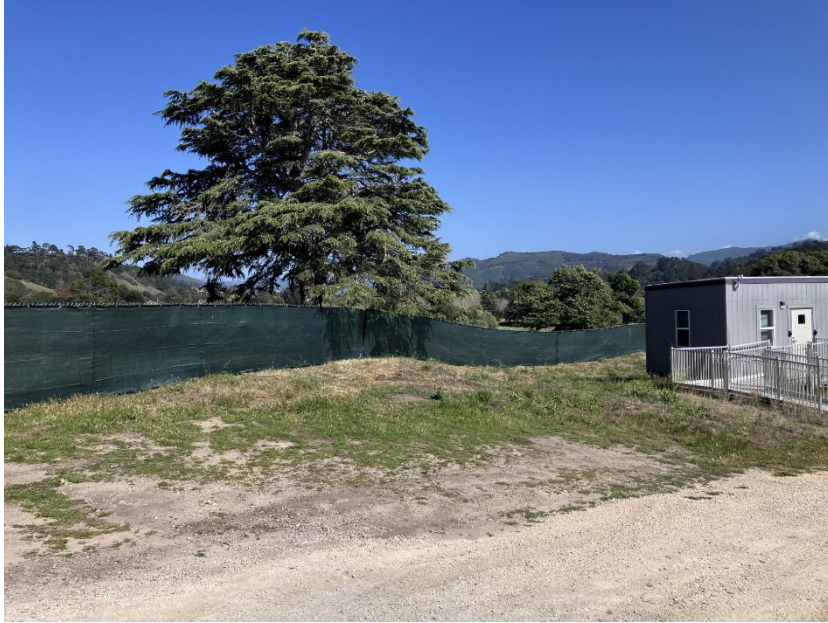
Photo 4: New construction fencing placed around the project perimeter.