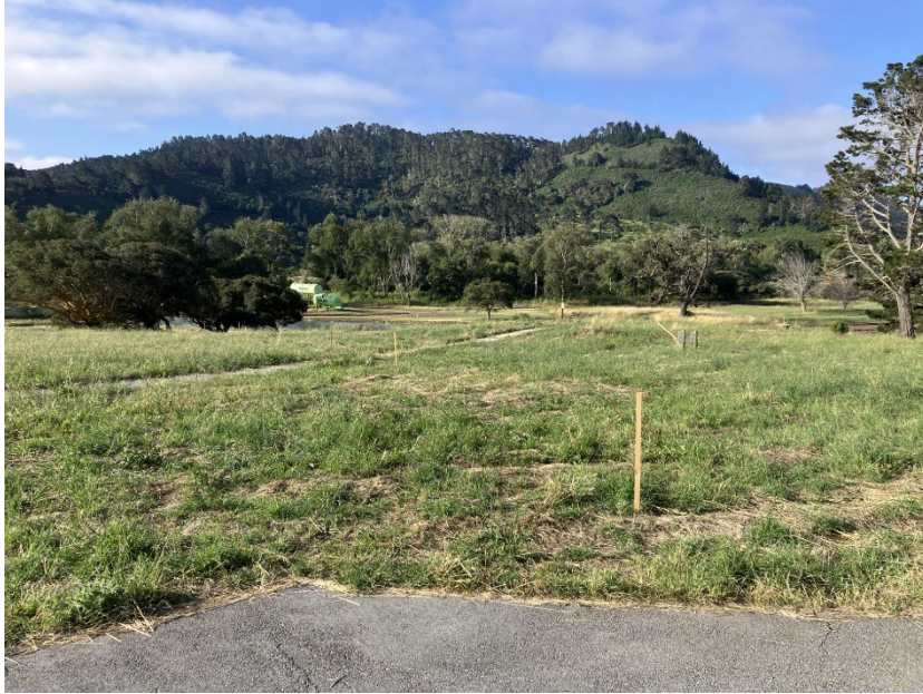
Photo 2: New trail alignments marked with stakes prior to construction.