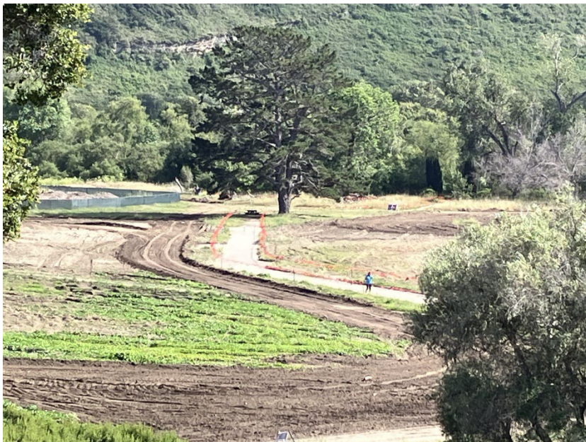
Photo 4: Flagged off public trail corridor within Phase 2 area prior to mass excavation activities.