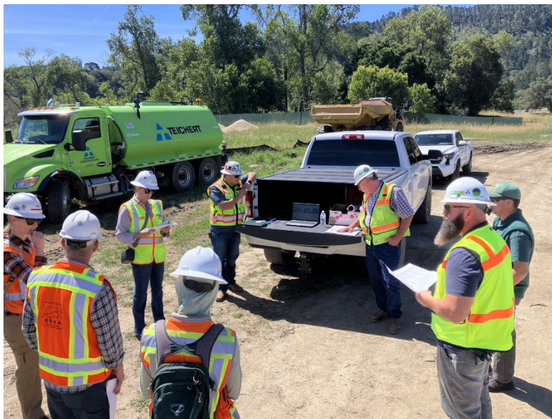
Photo 1: Phase 2 kickoff construction coordination meeting held in the field.