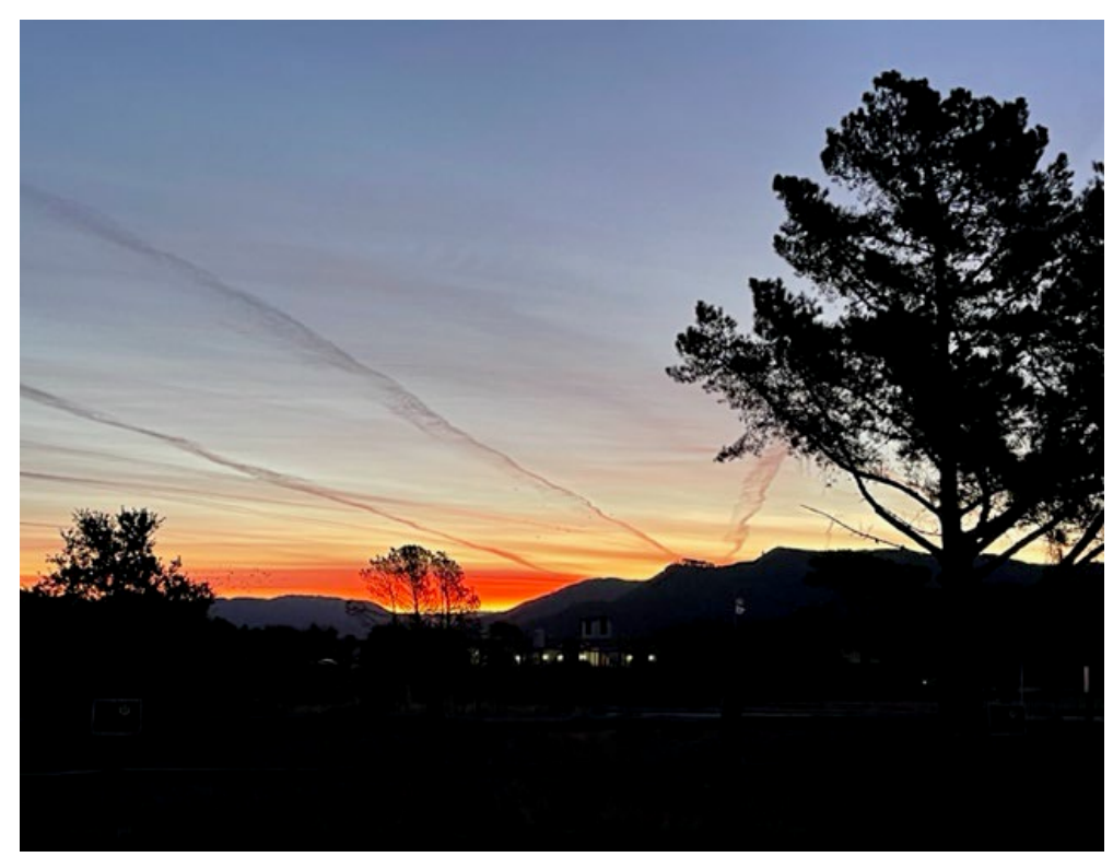
The Universe celebrating the imminent completion of Project-B