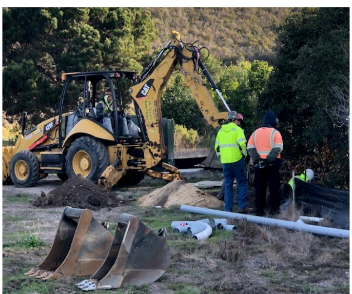
PG&E electrical installation