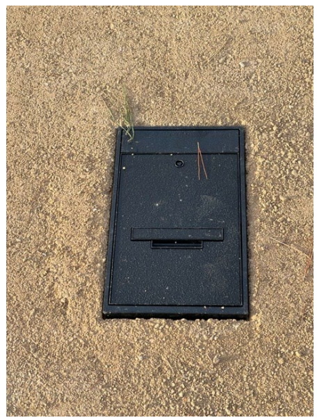
MP Pad electrical box

Final electrical work, in addition to PG&E's tasks, included wiring for electrical connections at the Multi-Purpose Pad. These electrical boxes will allow staff, vendors and/or presenter's to plug equipment in outdoors without stringing electrical cords across the property. SWCA continued to provide biological monitoring services for the project.