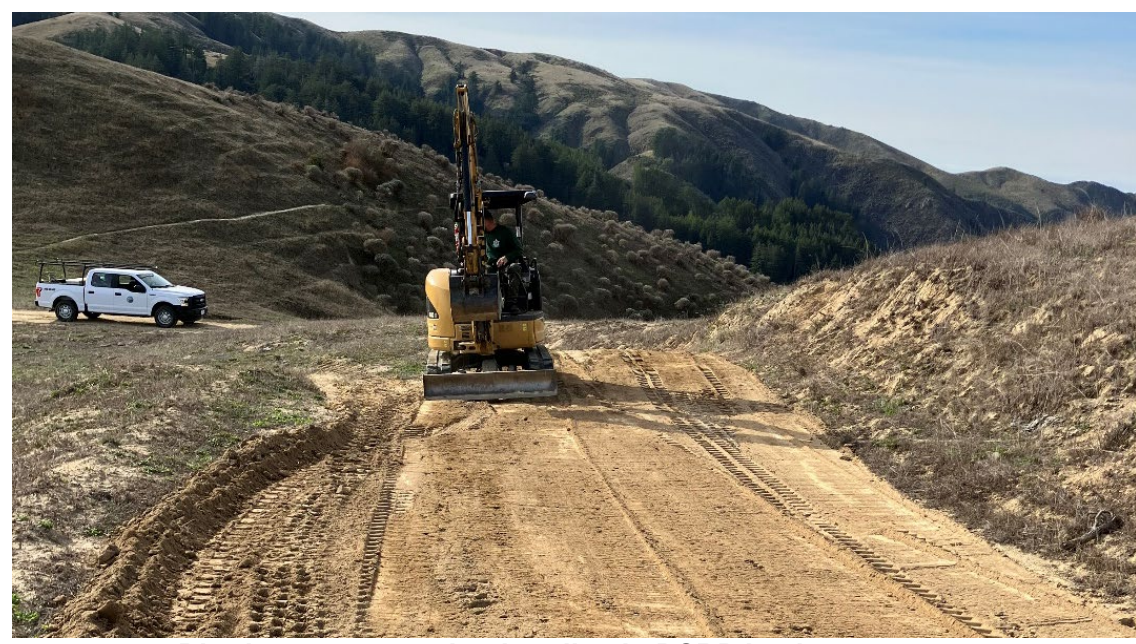
District excavator clearing dips in PCRP backcountry

Rangers have been taking the opportunity to address road drainage issues in the Palo Corona backcountry while soil moisture conditions are right (as we are also doing at Garland Park). Staff has been busy clearing drain dips, reshaping swales, outsloping, and spreading slough to regain road width. The big difference between trail work and road work is the ability to utilize equipment.