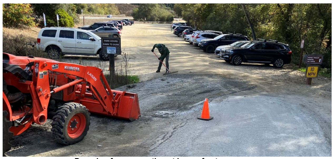
Prepping for compaction at base of entrance ramp