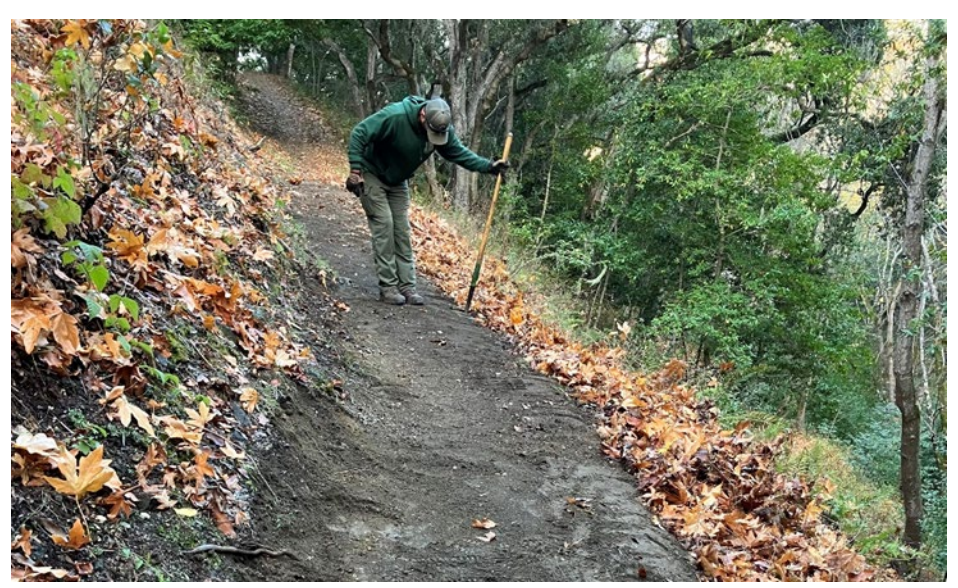
Segment of Live Oak Trail was out-sloped

This is the ideal time of year to schedule and implement trail repair/reconstruction projects, as soil moistures conditions are suitable for proper compaction. Rangers have been busy clearing drain dips, reshaping swales, and out-sloping sections of entrenched trail for proper drainage.