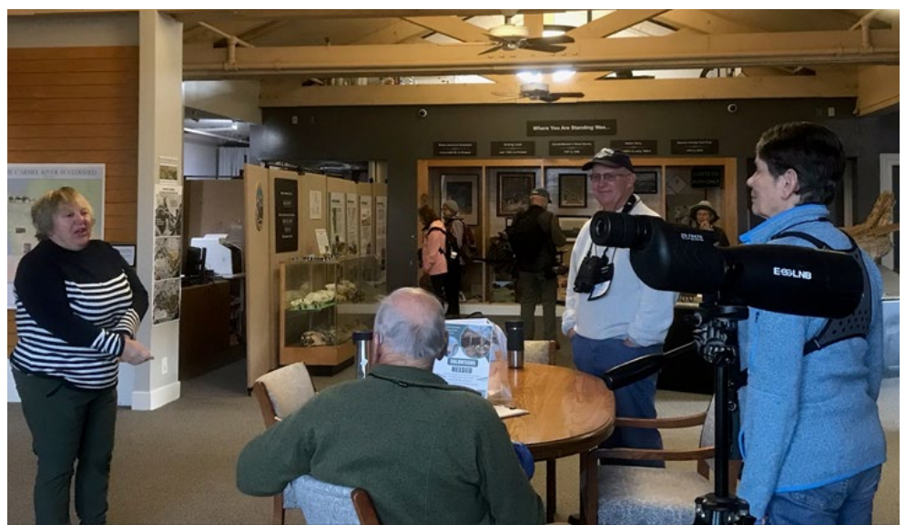
Staff greets Rhodes Scholar birding group in the Discovery Center.