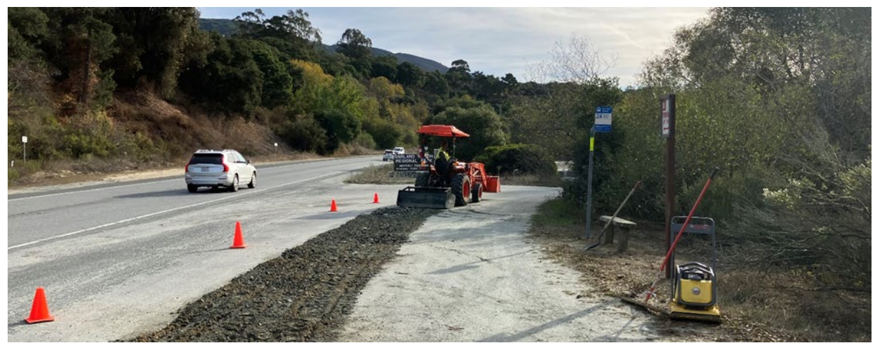
MPRPD staff and equipment "ripping" entrance ramp

Rangers completed the first round of parking lot repairs following the first series of winter storms. Each winter, staff spends several days filling and compacting potholes in the upper and lower parking lots at Garland Park. MPRPD equipment is utilized for this project, while the aggregate material is either purchased or delivered from a vendor.