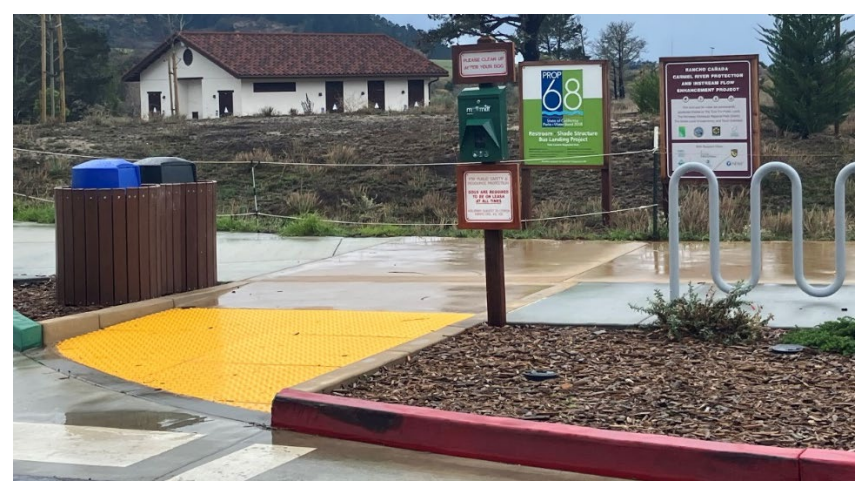
The sign states "Please clean up after your dog"

At the request of MPRPD's General Manager, a new mutt-mitt dispenser and garbage/recycle enclosure were installed adjacent to the bike rack at the Rancho Canada Unit trailhead. Prior to this installation, dog waste had accumulated in the adjacent planters. The improvements now allow dog owners to clean-up after their pets before they begin their hike.