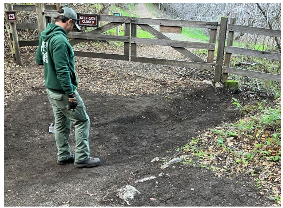
Maple Canyon Trail drain dip cleared and compacted