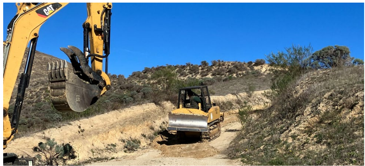
District SWECO spreading slough in PCRP backcountry