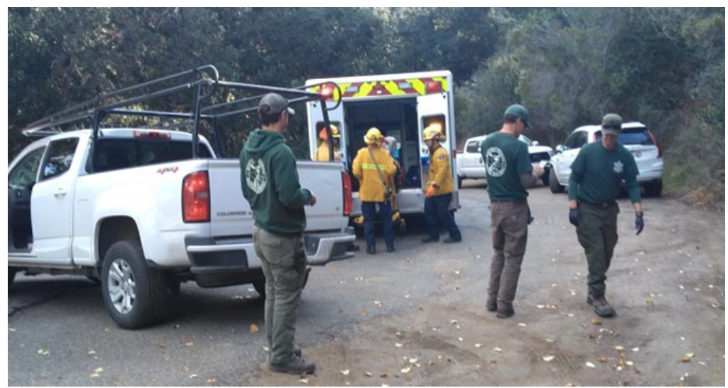
Patient being loaded into MCRFD ambulance

A rope rescue training drill is currently being planned for January at GRRP (more on this item next month).