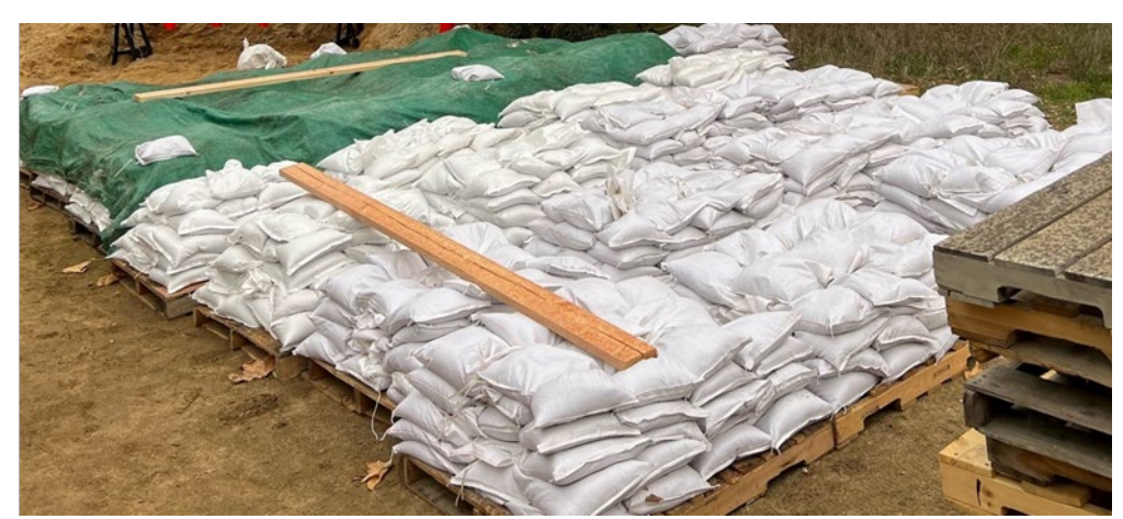
Sandbags were stacked onto pallets for ease of future movement