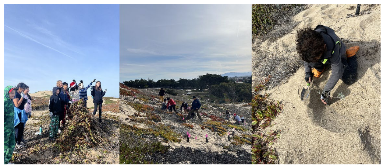
Volunteer students and members of the public participating in restoration activities at Marina Dunes Preserve